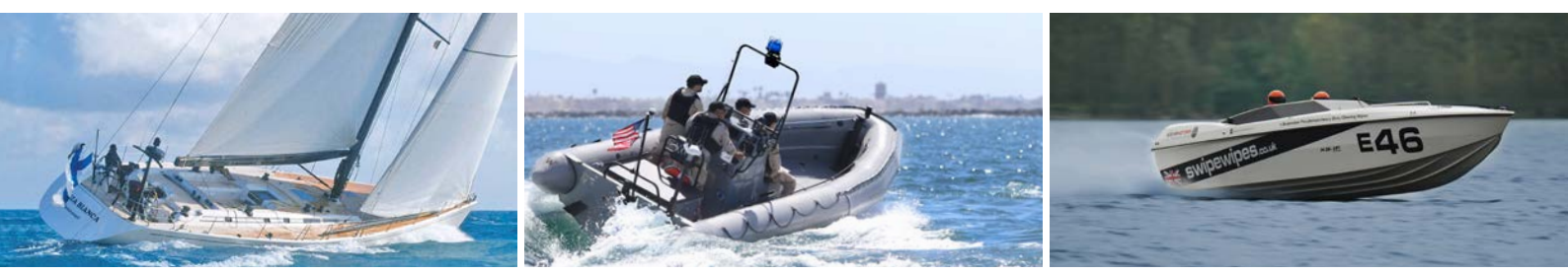
See more applications on our website or contact us for further references.