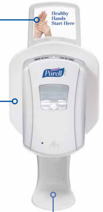
SHIELD™ Floor & Wall Protector 1045-WHT-12