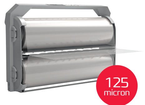
125 Micron Gloss Film Cartridge