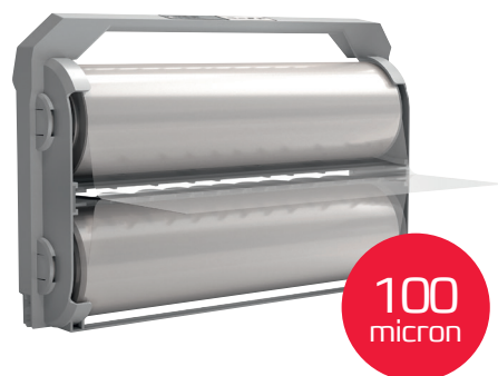
100 Micron Gloss Film Cartridge