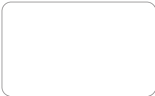
Use this sketch for ID Badges