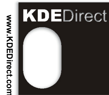
MOLDED GROMMETS (RUBBERIZED POLYMER)