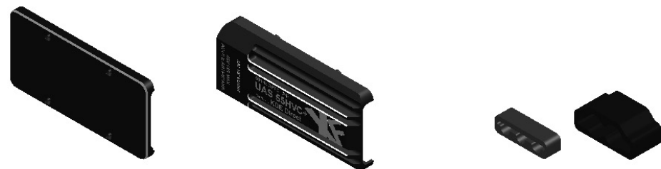
ALUMINUM CASES (6061-T6)

4.0MM BULLET CONNECTORS 24K, MATCHING PAIR (2 SETS)