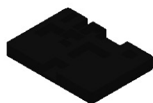
DIE-CUT FOAM BACKING