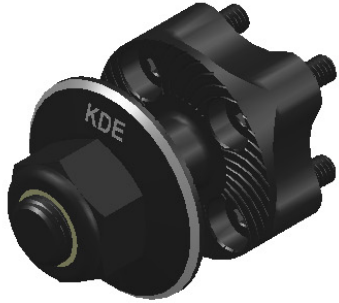
KDE M10 PROPELLER ADAPTER ASSEMBLY 102XX/82XX/72XX SERIES 23MM EDITION, RH THREAD

SOCKET HEAD CAP SCREWS M4 X 0.7 X 12MM (4) ALLOY-STEEL BLACK OXIDE, C12.9 BLACK M10 ALLOY STEEL NYLON-INSERT LOCKNUT (1)