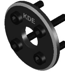
KDE M10 PROPELLER SHAFT COVER ASSEMBLY 102XX/82XX/72XX SERIES 20MM EDITION, M3

SOCKET HEAD CAP SCREWS M4 X 0.7 X 12MM (4) ALLOY-STEEL BLACK OXIDE, C12.9 BLACK M8 ALLOY STEEL NYLON-INSERT LOCKNUT (1)