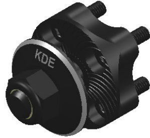
KDE M8 PROPELLER ADAPTER ASSEMBLY 82XX/72XX SERIES 23MM EDITION, RH THREAD

SOCKET HEAD CAP SCREWS M4 X 0.7 X 12MM (4) ALLOY-STEEL BLACK OXIDE, C12.9 BLACK M10 ALLOY STEEL NYLON-INSERT LOCKNUT (1)