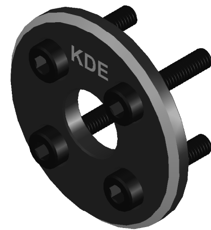
KDE M10 PROPELLER SHAFT COVER ASSEMBLY 102XX/82XX/72XX SERIES 20MM EDITION, M3

SOCKET HEAD CAP SCREWS M3 X 0.5 X 14MM (4) ALLOY-STEEL BLACK OXIDE, C12.9