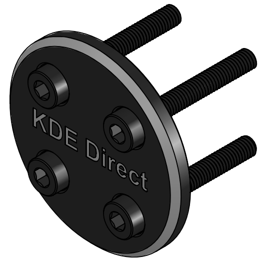
KDE PROP BRACKET ASSEMBLY 102XX/82XX/72XX/68XX 20MM EDITION, M3 BLACK EDITION

SOCKET HEAD CAP SCREWS M3 X 0.5 X 15MM (4) ALLOY-STEEL BLACK OXIDE, C12.9