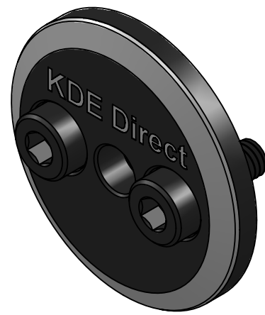
KDE PROP BRACKET ASSEMBLY 62XX/52XX/42XX BLACK EDITION

SOCKET HEAD CAP SCREWS M3 X 0.5 X 15MM (4) ALLOY-STEEL BLACK OXIDE, C12.9