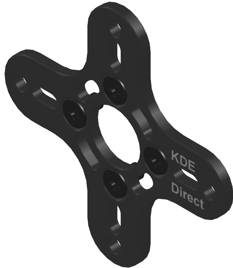
KDE MOTOR ADAPTER PLATE ASSEMBLY 42XX/40XX/35XX SERIES BLACK EDITION

FLAT HEAD PHILLIPS MACHINE SCREWS M4 X 0.7 X 8MM (4) ALLOY-STEEL BLACK OXIDE, C12.9