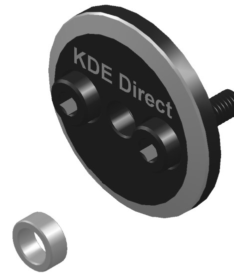
KDE PROPELLER BRACKET ASSEMBLY 62XX/52XX/42XX/40XX/35XX SERIES BLACK EDITION

FLAT HEAD PHILLIPS MACHINE SCREWS M4 X 0.7 X 8MM (4) ALLOY-STEEL BLACK OXIDE, C12.9