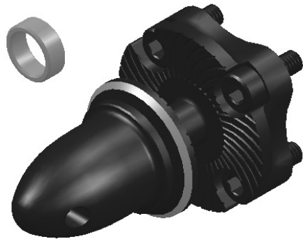
KDE M6 PROPELLER ADAPTER ASSEMBLY 62XX/52XX/42XX/40XX/35XX SERIES 20MM EDITION, RH THREAD

SOCKET HEAD CAP SCREWS M3 X 0.5 X 8MM (4) ALLOY STEEL BLACK-OXIDE, C12.9