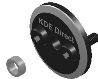
KDE PROPELLER BRACKET ASSEMBLY 62XX/52XX/42XX/40XX/35XX SERIES BLACK EDITION

FLAT HEAD SOCKET HEAD CAP SCREWS M4 x 0.7 x 8MM (4) ALLOY STEEL BLACK-OXIDE, C12.9