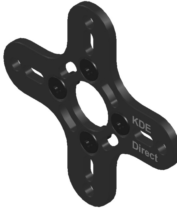
KDE MOTOR ADAPTER PLATE ASSEMBLY 42XX/40XX/35XX SERIES BLACK EDITION

FLAT HEAD SOCKET HEAD CAP SCREWS M4 x 0.7 x 8MM (4) ALLOY STEEL BLACK-OXIDE, C12.9