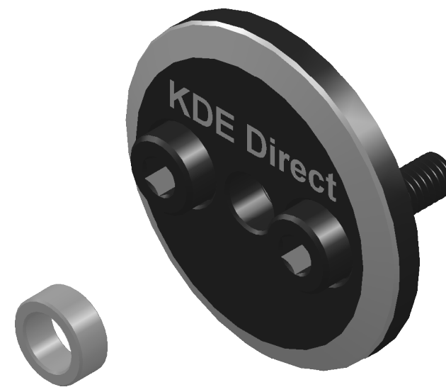
KDE PROPELLER BRACKET ASSEMBLY 62XX/52XX/42XX/40XX/35XX SERIES BLACK EDITION

FLAT HEAD SOCKET HEAD CAP SCREWS M4 x 0.7 x 8MM (4) ALLOY STEEL BLACK-OXIDE, C12.9