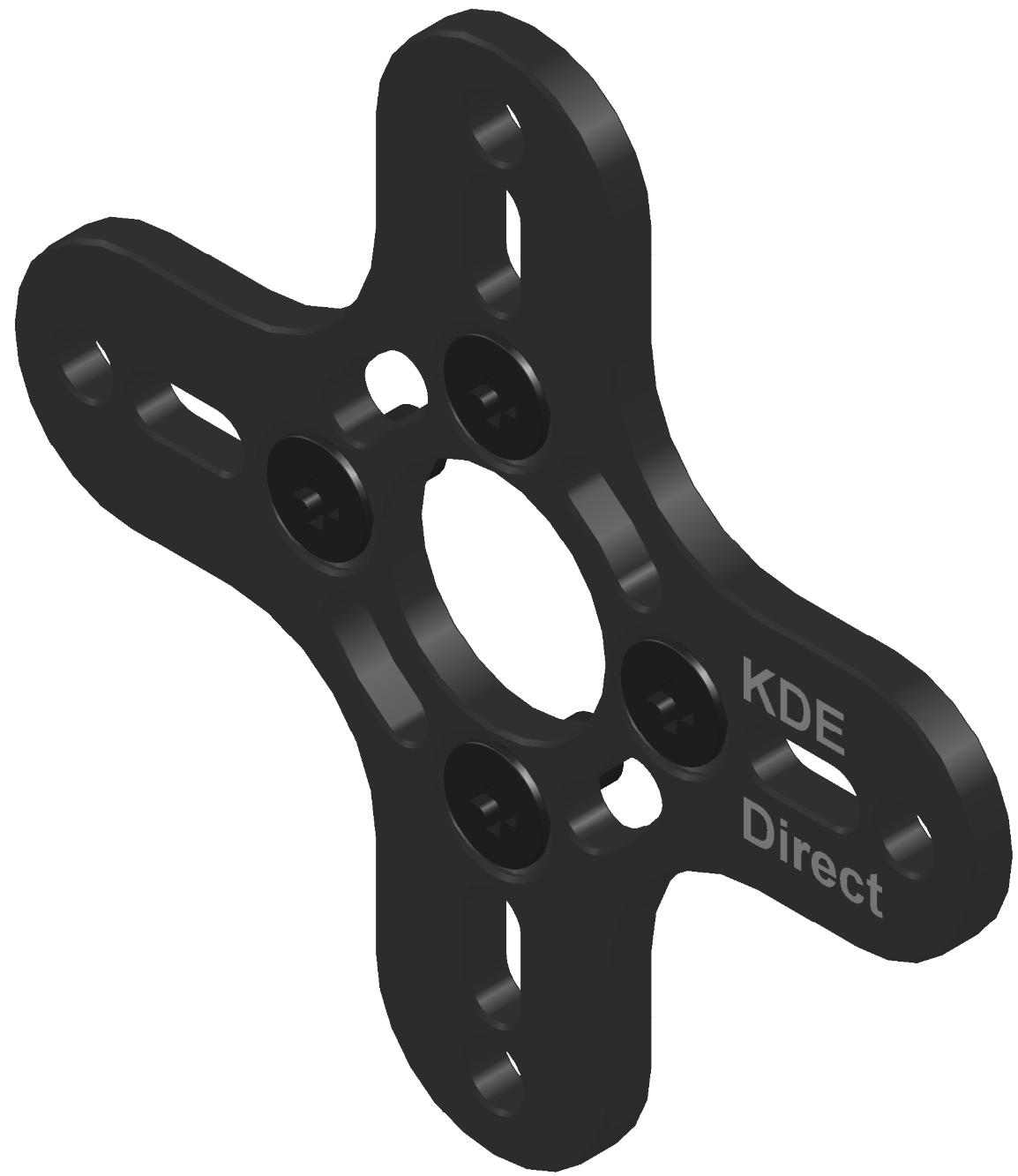
KDE MOTOR ADAPTER PLATE ASSEMBLY 42XX/40XX/35XX SERIES BLACK EDITION

FLAT HEAD SOCKET HEAD CAP SCREWS M4 x 0.7 x 8MM (4) ALLOY STEEL BLACK-OXIDE, C12.9