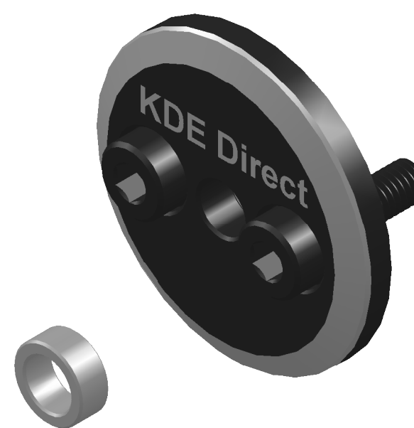
KDE PROPELLER BRACKET ASSEMBLY 62XX/52XX/42XX/40XX/35XX SERIES BLACK EDITION

FLAT HEAD SOCKET HEAD CAP SCREWS M4 x 0.7 x 8MM (4) ALLOY STEEL BLACK-OXIDE, C12.9