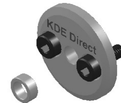
KDE PROPELLER BRACKET ASSEMBLY 28XX SERIES CLEAR EDITION

FLAT HEAD SOCKET HEAD CAP SCREWS M3 X 0.5 X 6MM (4) ALLOY-STEEL ZINC-PLATED, C12.9