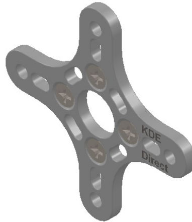
KDE MOTOR ADAPTER PLATE ASSEMBLY 28XX SERIES CLEAR EDITION

SOCKET HEAD CAP SCREWS M3 X 0.5 X 8MM (3) ALLOY-STEEL BLACK OXIDE, C12.9