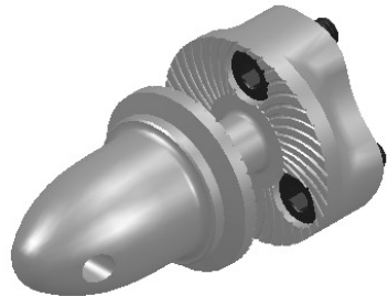
KDE M6 PROPELLER ADAPTER ASSEMBLY 28XX SERIES 15MM EDITION, RH THREAD

SOCKET HEAD CAP SCREWS M3 X 0.5 X 8MM (3) ALLOY-STEEL BLACK OXIDE, C12.9