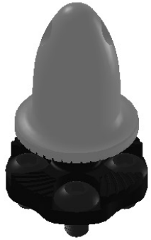
KDE M6 PROPELLER ADAPTER ASSEMBLY 23XX SERIES 12MM EDITION, RH THREAD

BUTTON HEAD SOCKET HEAD CAP SCREWS M3 X 0.5 X 5MM (4) ALLOY-STEEL BLACK OXIDE, C12.9