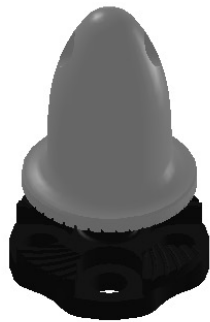
KDE M5 PROPELLER ADAPTER ASSEMBLY 23XX SERIES 12MM EDITION, RH THREAD

BUTTON HEAD SOCKET HEAD CAP SCREWS M3 X 0.5 X 5MM (4) ALLOY-STEEL BLACK OXIDE, C12.9