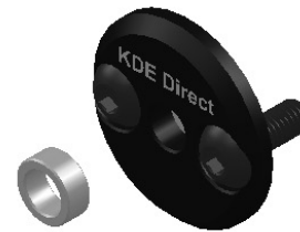
KDE PROPELLER BRACKET ASSEMBLY 23XX SERIES BLACK EDITION

BUTTON HEAD SOCKET HEAD CAP SCREWS M3 X 0.5 X 8MM (2) ALLOY-STEEL BLACK OXIDE, C12.9 4MM/6MM ADAPTER