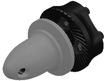
KDE M5 PROPELLER ADAPTER ASSEMBLY 23XX/18XX SERIES 9MM EDITION, RH THREAD

SOCKET HEAD CAP SCREWS M2 X 0.4 X 5MM (4) ALLOY-STEEL BLACK OXIDE, C12.9