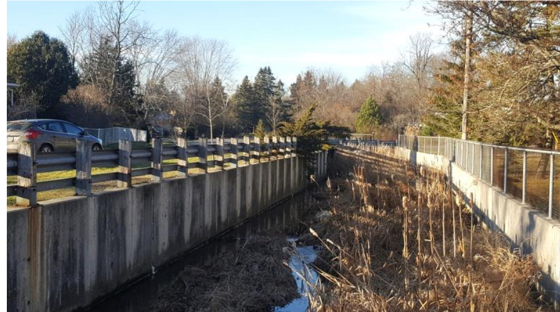
Highgate Creek Channelization