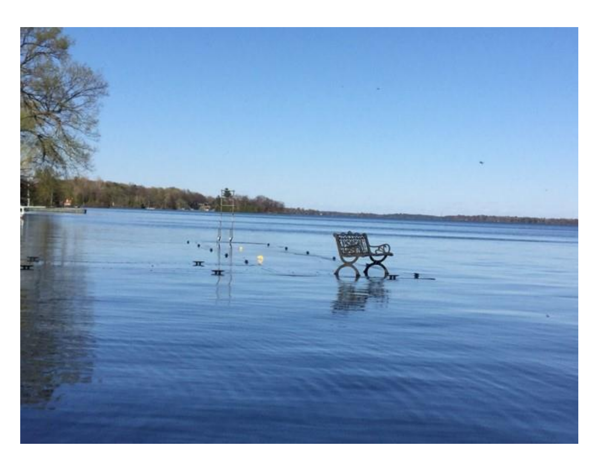
Gananoque, St. Lawrence River (May 2017)