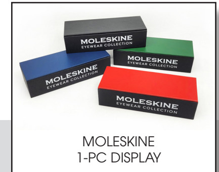
MOLESKINE 1-PC DISPLAY