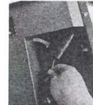
Connect side in head