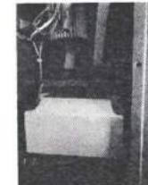
Connect side in pumps