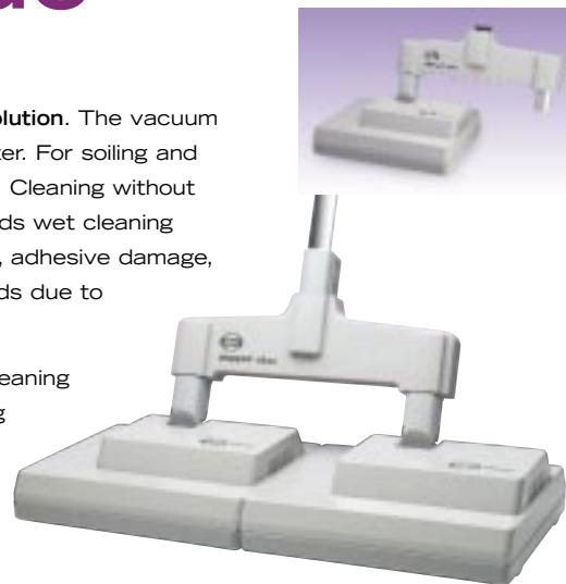
With the dopple, two standard duo machines can be linked together to create a 70cm (28") machine