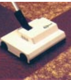
Effective brush action