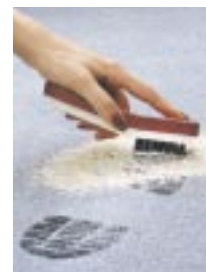
The lid of the duo•P powder box doubles as an easy to use brush