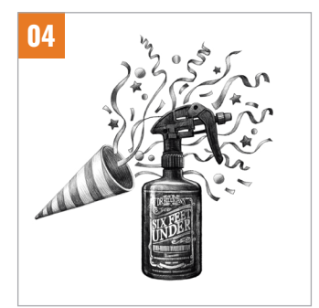
SHAKE THE BOTTLE