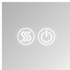
Touch sensors for light and demister

While we aim to ensure specifications are correct at the time of publication, Fienza reserves the right to make modifications without prior notice. Physical colour may vary from image shown. All measurements are shown in millimetres. Always use physical product measurements for mark-ups and roughing-in as the technical drawing may differ from actual product received.