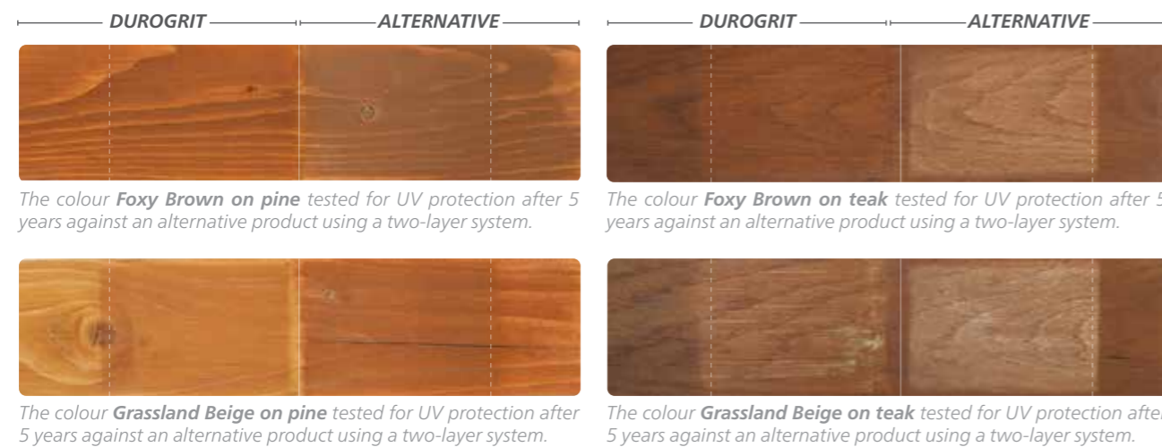
The colour Foxy Brown on pine tested for UV protection after 5 years against an alternative product using a two-layer system.

We don't just say our UV resistance is superior to the market, we also prove it. The wood samples below are results of extensive QUV tests in our laboratory according to the norm EN 927-6. A QUV test is an accelerated weathering tester and rapidly simulates the damage caused by sunlight, rain and dew. This way, in just a matter of weeks, we can reproduce what the damage would be in several years of outdoor exposure.