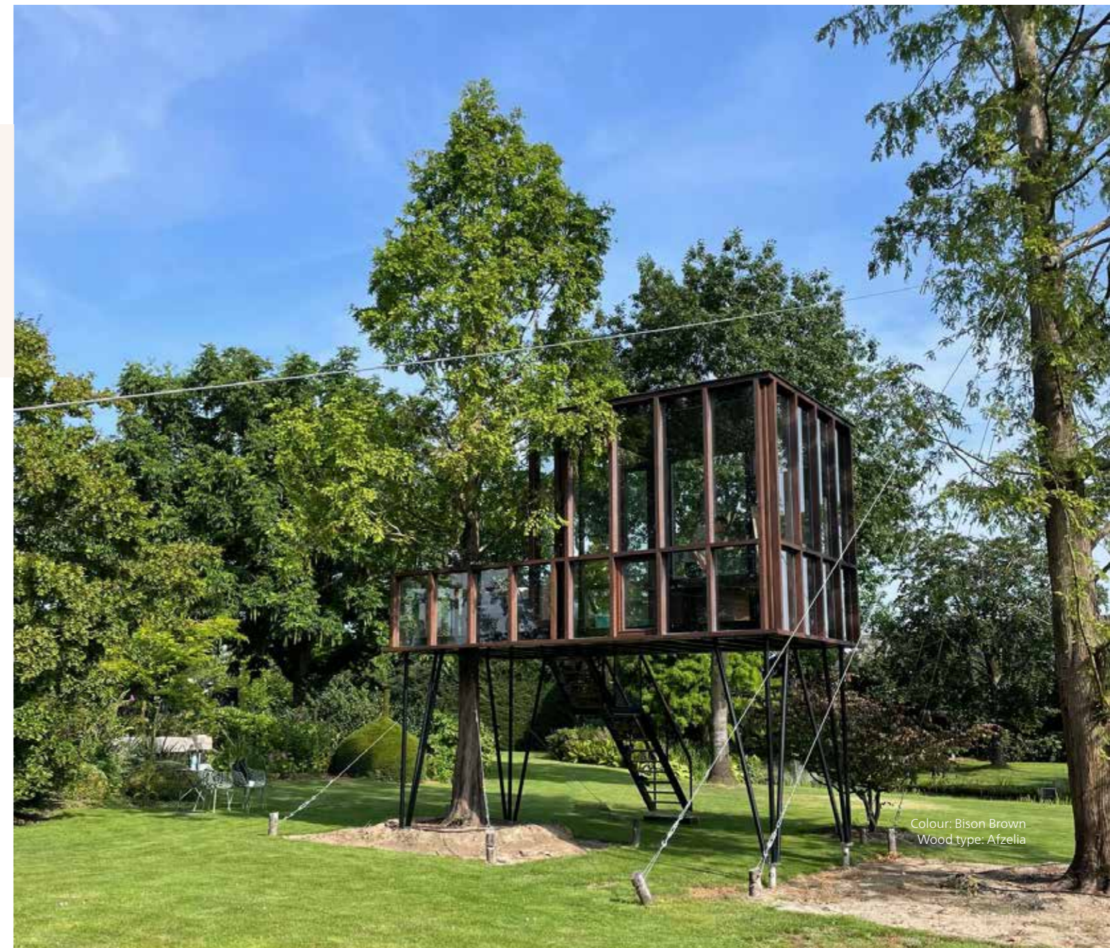
Colour: Bison Brown Wood type: Afzelia