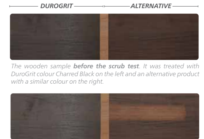
The wooden sample before the scrub test . It was treated with DuroGrit colour Charred Black on the left and an alternative product with a similar colour on the right.

The left half of the wooden boards were treated with DuroGrit, the right half with an alternative product. Part of the board was placed under a small brush which moved back and forth 600 times. This wears off the protection and shows how mechanically resistant DuroGrit is against alternative products on the market. As you can see, DuroGrit offers excellent mechanical resistance.