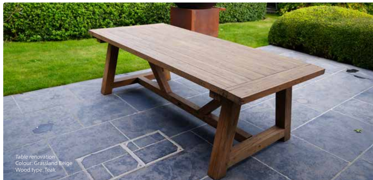
Table renovation Colour: Grassland Beige Wood type: Teak

The results clearly show that the DuroGrit colours are better preserved than those of the alternative product.