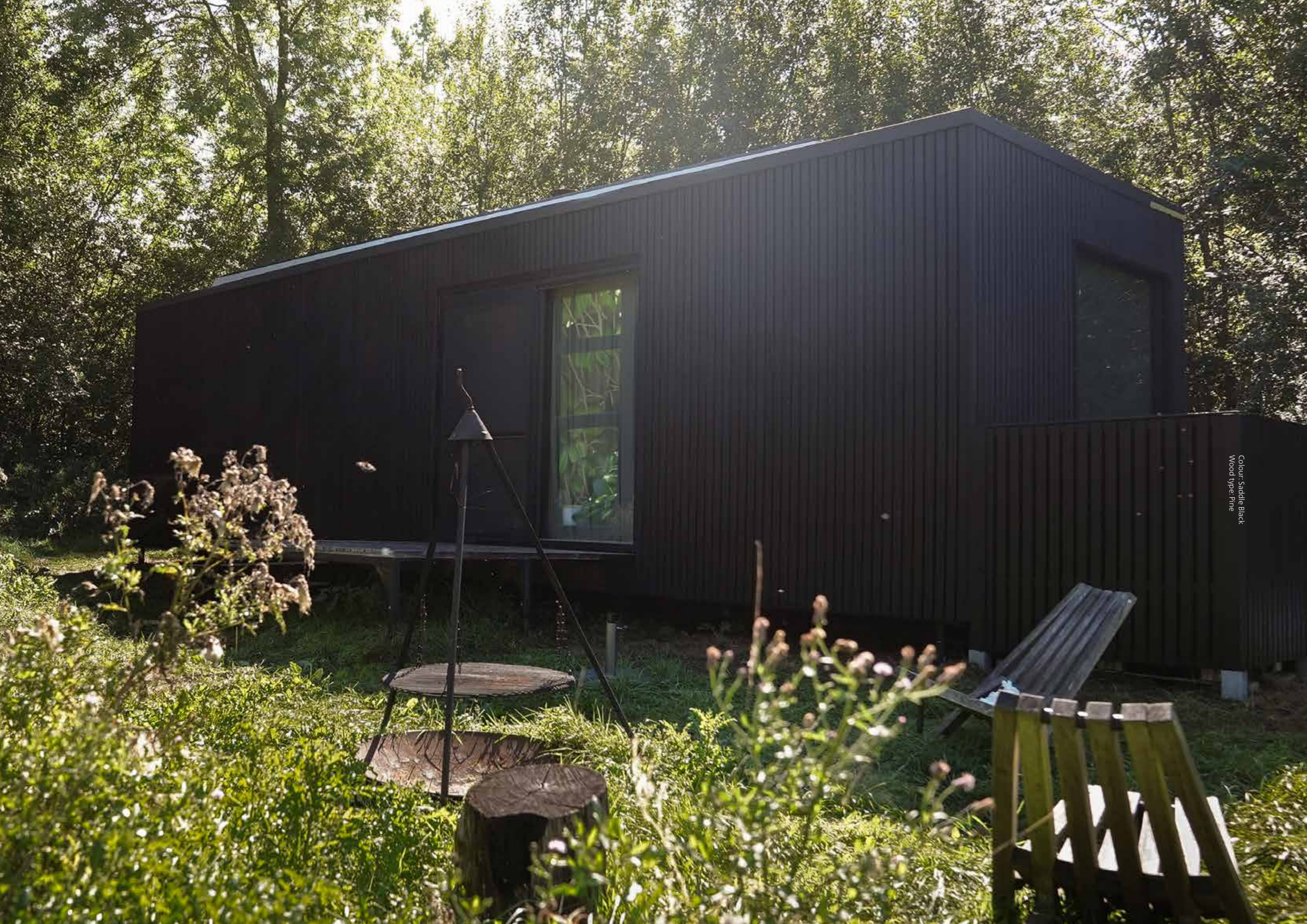
Colour: Saddle Black Wood type: Pine