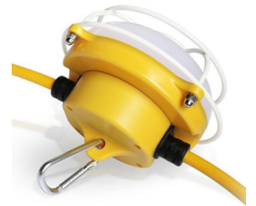
Carabiner Allows for Easy Mounting