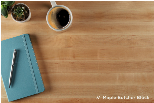
// Maple Butcher Block