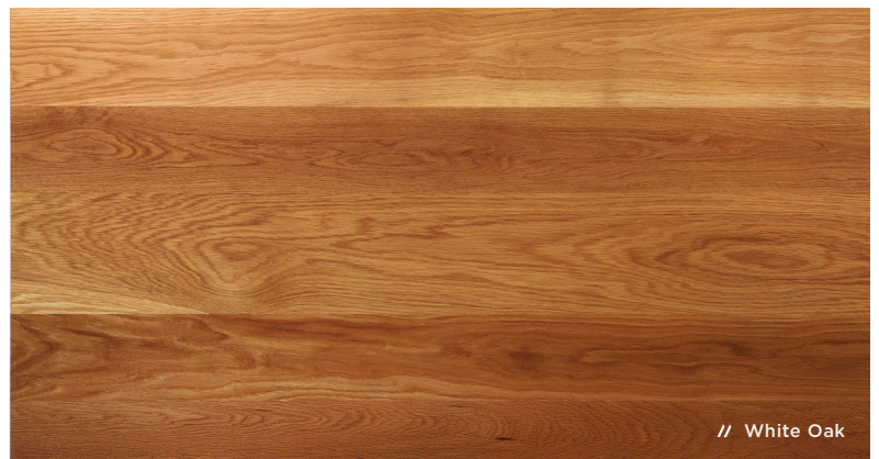
// White Oak