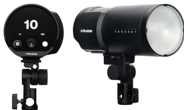
Profoto B10X Plus