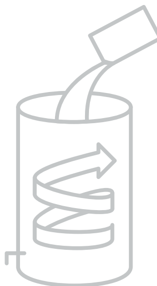
Pour WildBrew Sour Pitch™ into unhopped wort