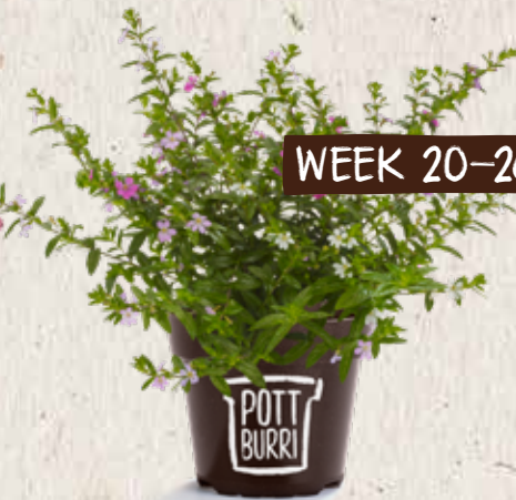
CUPHEA TRIO „FLORY GLORY“