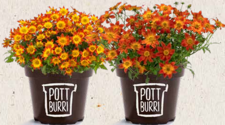
BIDENS „BEE DANCE“