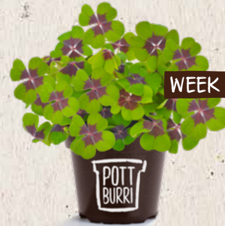
OXALIS „LUCKY CLOVER“