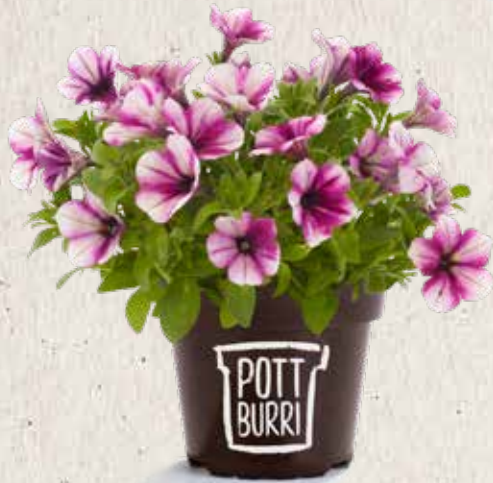
PETUNIA „PURPLE TOUCH“