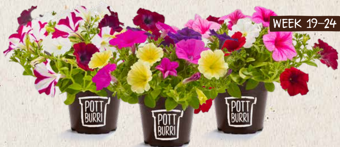
PETUNIA „WAVE TRIO“