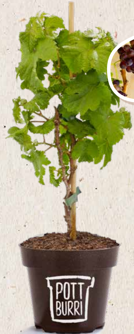
GRAPE VINES „CARBENET FRANCE“