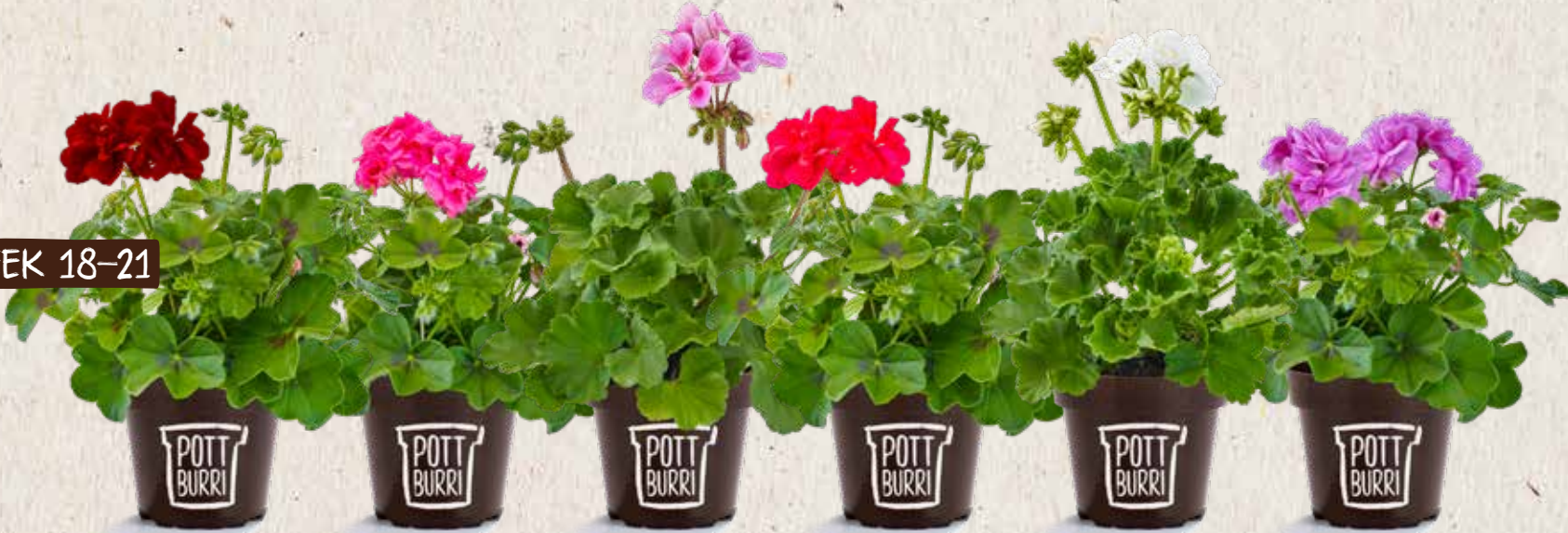
GERANIUMS IN SPECIAL VARIETIES