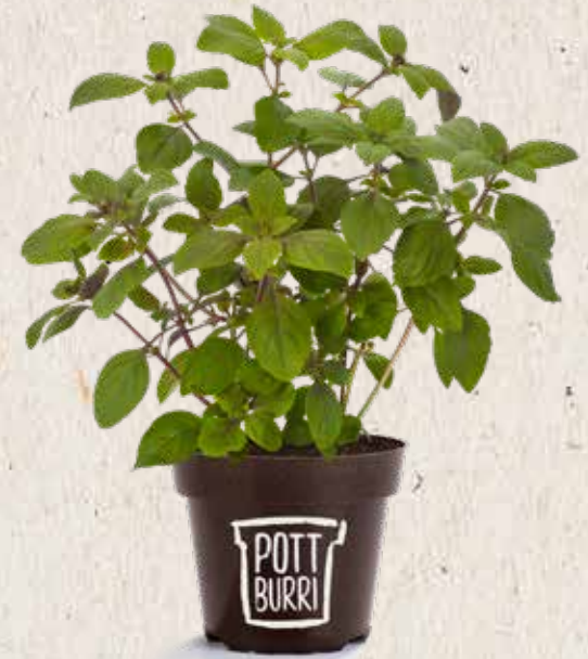
ORGANIC SHRUB BASIL