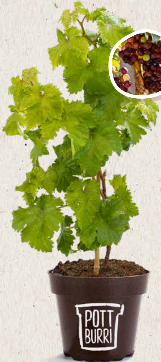
GRAPE VINES „PINOT NOIR“