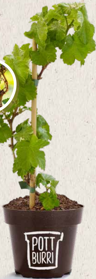
GRAPE VINES „RIESLING“