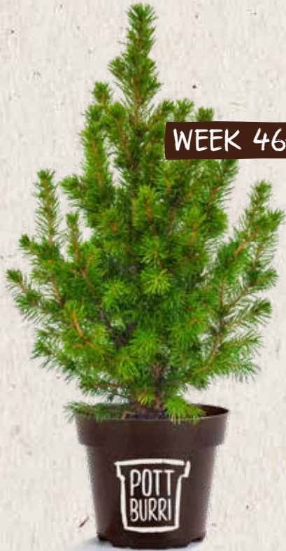
MINI FIR TREE