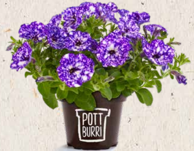
PETUNIA „NIGHT SKY“