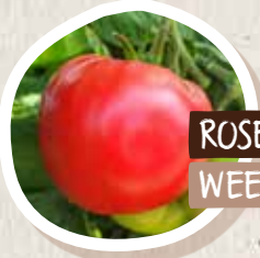
ROSE CRUSH WEEK 15-23