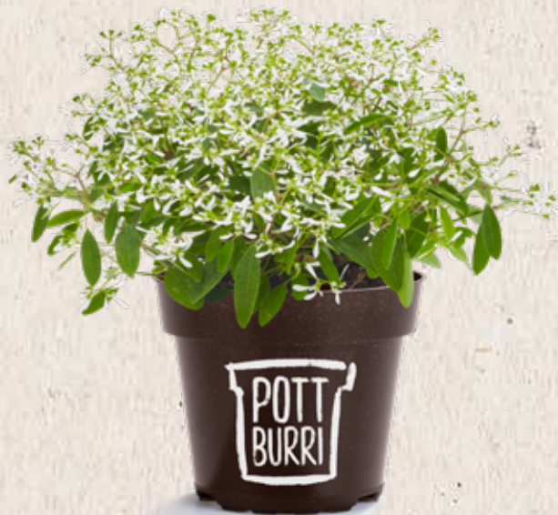
EUPHORBIA „DIAMOND FROST“