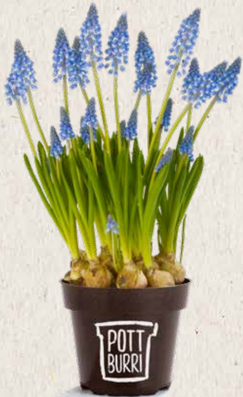
PREMIUM MUSCARI „BLUE SMILE“