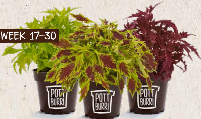
COLEOS-MIX „FLAME THROWER“