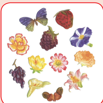
Fruits & Flowers