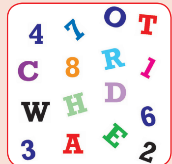
Alphabet & Numbers