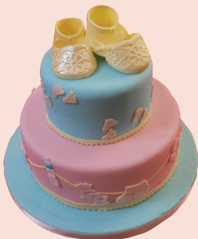
Cake for illustration purposes showing how the booties can be displayed.

See the FMM catalogue for the full range of products.