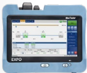
Access OTDR MAX-720C-Q1/QUAD