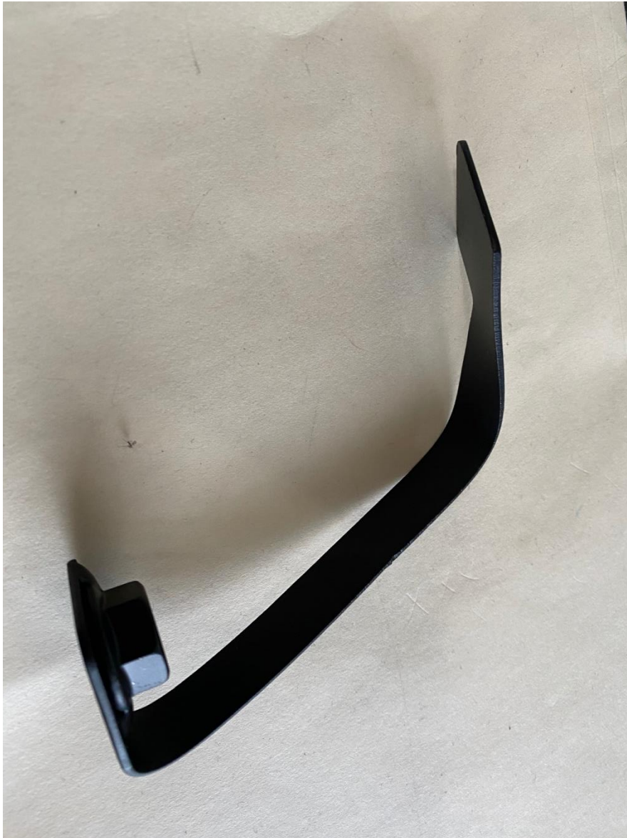
Figure 1 - “Nut on a Stick”:

Recheck all the bolts after installation to verify they are tight. Congratulations on your new armor modifications. We hope that our products serve you well and hope to have a continued relationship with you for all your off-road needs. Be sure to share your photos and tag us on Instagram and Facebook at @heftyfabworks.