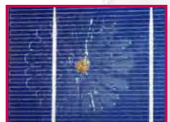
Laminated lady bug