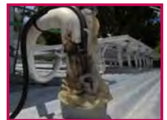
Poor installation quality