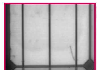
Micro crack between bus bars