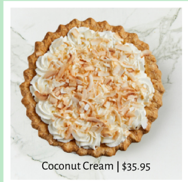
Coconut Cream | $35.95