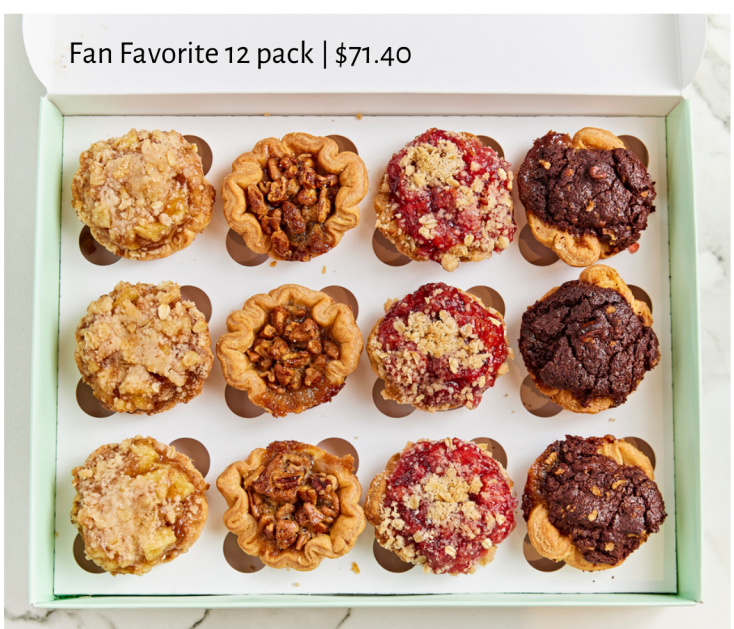
3 Apple Crumb, 3 Sweet Texas Pecan, 3 Cherry Crumb, and 3 Texas Two Step