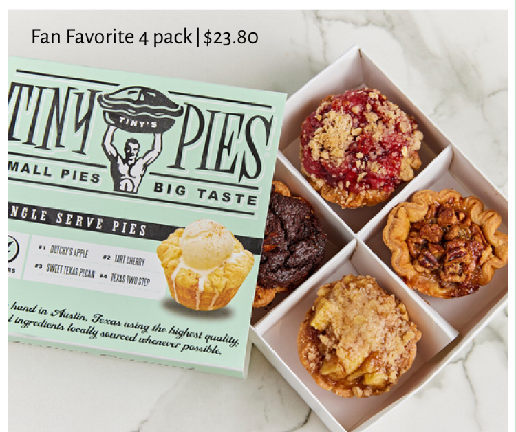
1 Cherry Crumb, 1 Sweet Texas Pecan, 1 Texas Two Step, and 1 Apple Crumb