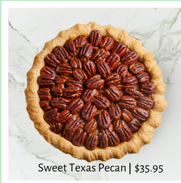
Sweet Texas Pecan | $35.95