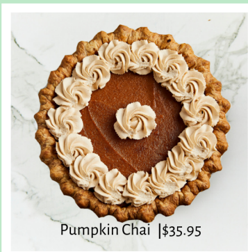
Pumpkin Chai | $35.95