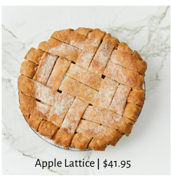
Apple Lattice | $41.95