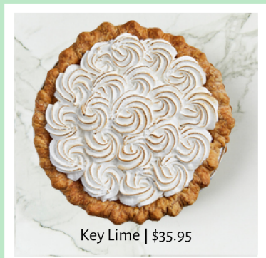
Key Lime | $35.95