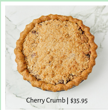
Cherry Crumb | $35.95