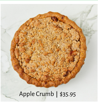
Apple Crumb | $35.95