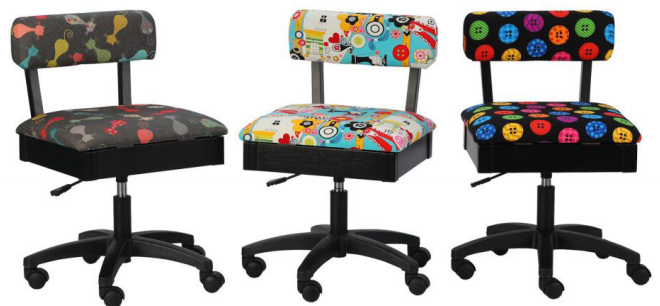
Cat's Meow, Sew Wow Sew Now & Bright Buttons Chairs

The cherry on top of your sewing sundae! Arrow's #1 Rated Height Adjustable Sewing Chair is a must have accessory for your dream sewing room! Cute, comfortable and convenient - our lovable chairs feature vibrant sewing themed patterns, 360° swivel access and lumbar support for long hours at your workstation. Don't look now, but under every seat cushion is a hidden storage compartment to store your notions and patterns! Available in 10 colors to perfectly match your sewing sanctuary!