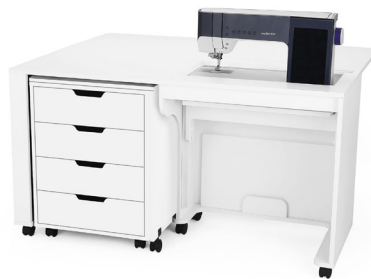
Laverne & Shirley Sewing Cabinet

Sewing cabinets provide comfort, easy set-up, dedicated storage for your machine and notions, different positions for better sewing posture and a spirited environment for crafting. Your machine deserves better than the dining room table! Sew in comfort, sew longer!