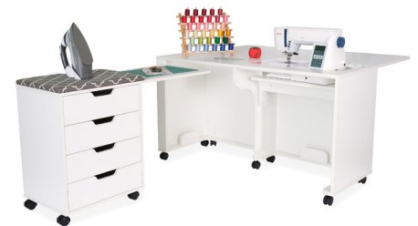
Laverne & Shirley Sewing Cabinet