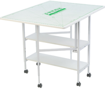
Dixie Cutting Table

Arrow sewing cabinet - check! Now add even more convenience to your studio with a dedicated cutting table like Dixie , specially designed to complement your primary Arrow sewing cabinet. Add style, storage and comfort to your growing sewing oasis!