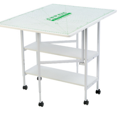
Dixie Cutting Table

Arrow sewing cabinet - check! Now add even more convenience to your studio with a dedicated cutting table like Dixie, specially designed to complement your primary Arrow sewing cabinet. Add style, storage and comfort to your growing sewing oasis!