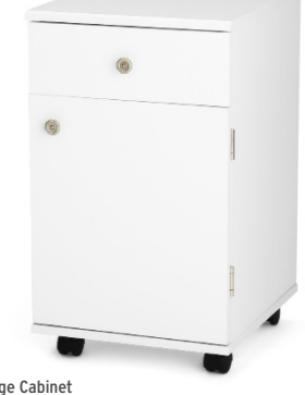
Suzi Storage Cabinet

There can never be too much storage space in your sewing room! Arrow's dedicated storage cabinets are designed for organization and accessibility. Arrow's Suzi , features 4 dedicated storage drawers and comes in Oak and White finishes! Cute and functional!