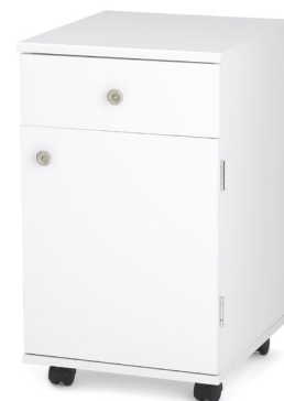
Suzi Storage Cabinet

There can never be too much storage space in your sewing room! Arrow's dedicated storage cabinets are designed for organization and accessibility. Arrow's Suzi , features 4 dedicated storage drawers and comes in Oak and White finishes! Cute and functional!