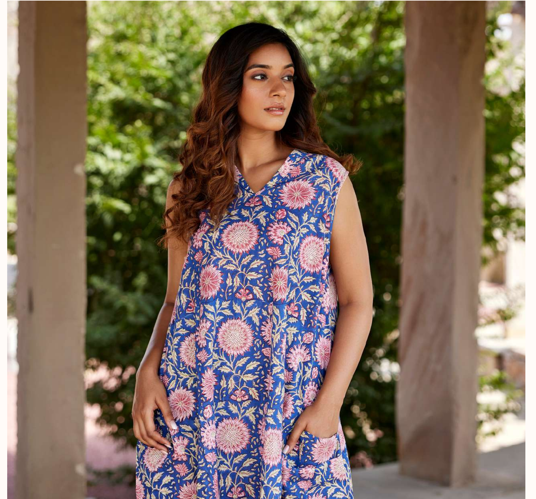
BLOCK PRINT BLUE JAAL COTTON SHORT DRESS