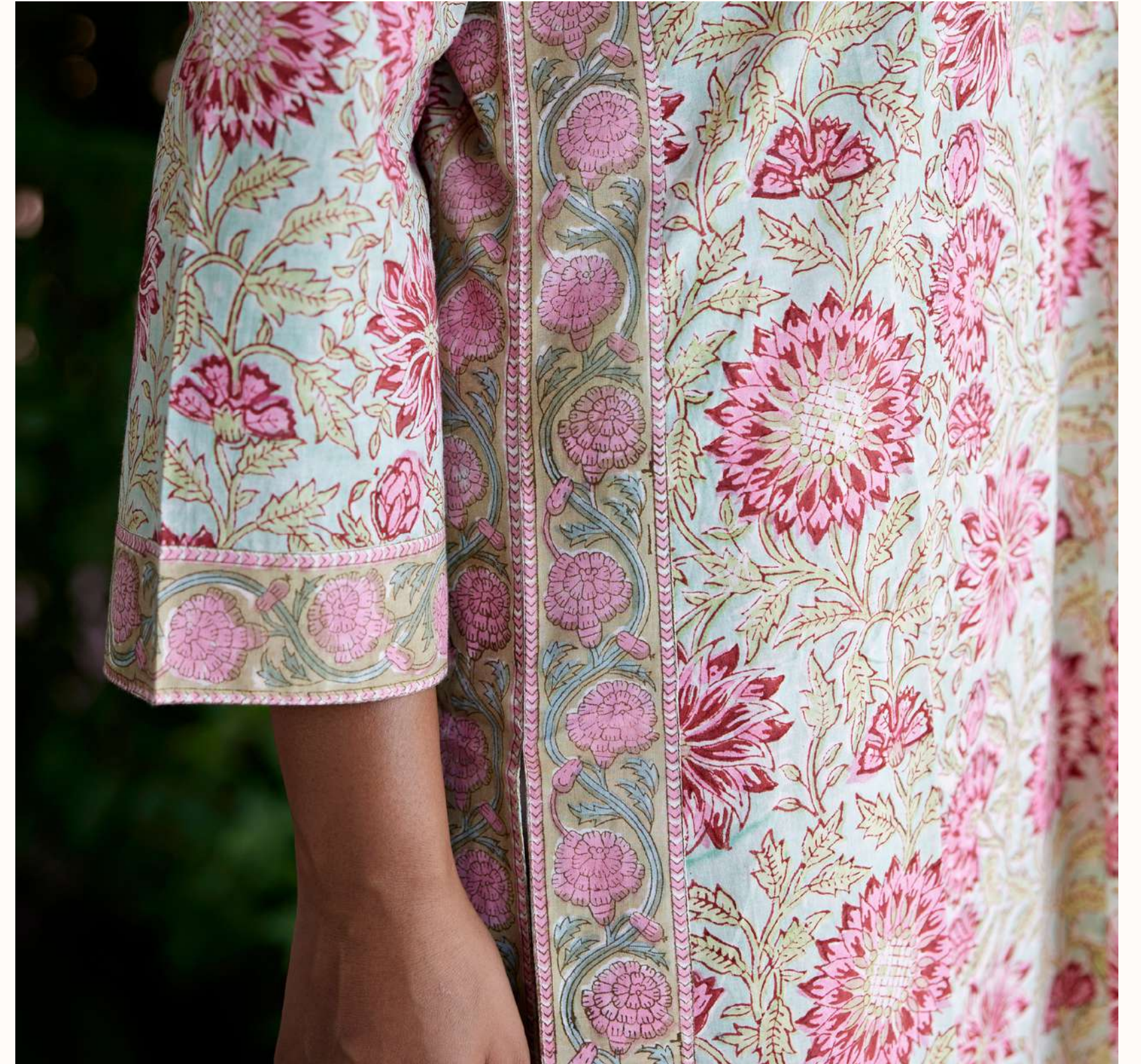
BLOCK MINT ZAAL PANEL KURTA SET