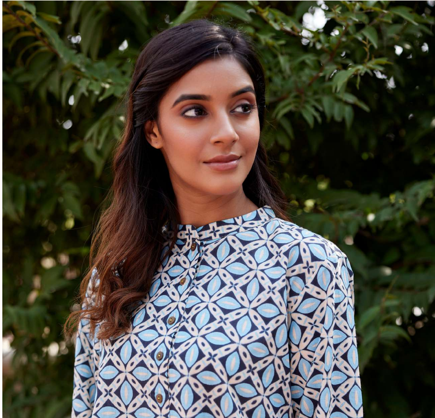
GEOMETRIC BLOCK PRINT CO-ORD SET