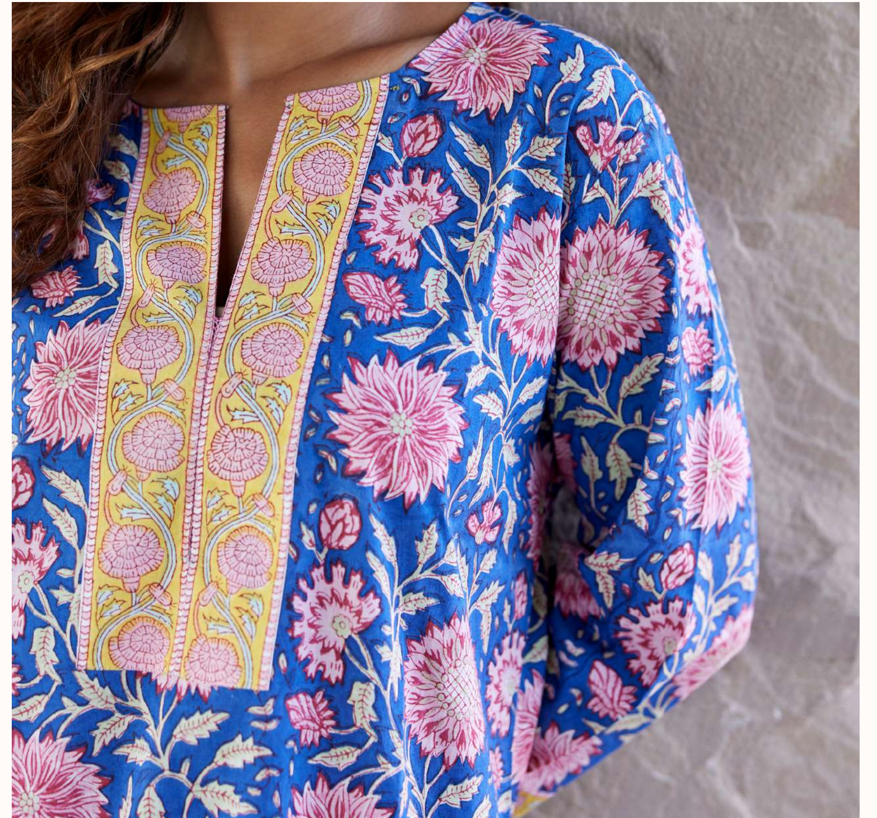
INDIGO ZAAL BLOCK KURTA