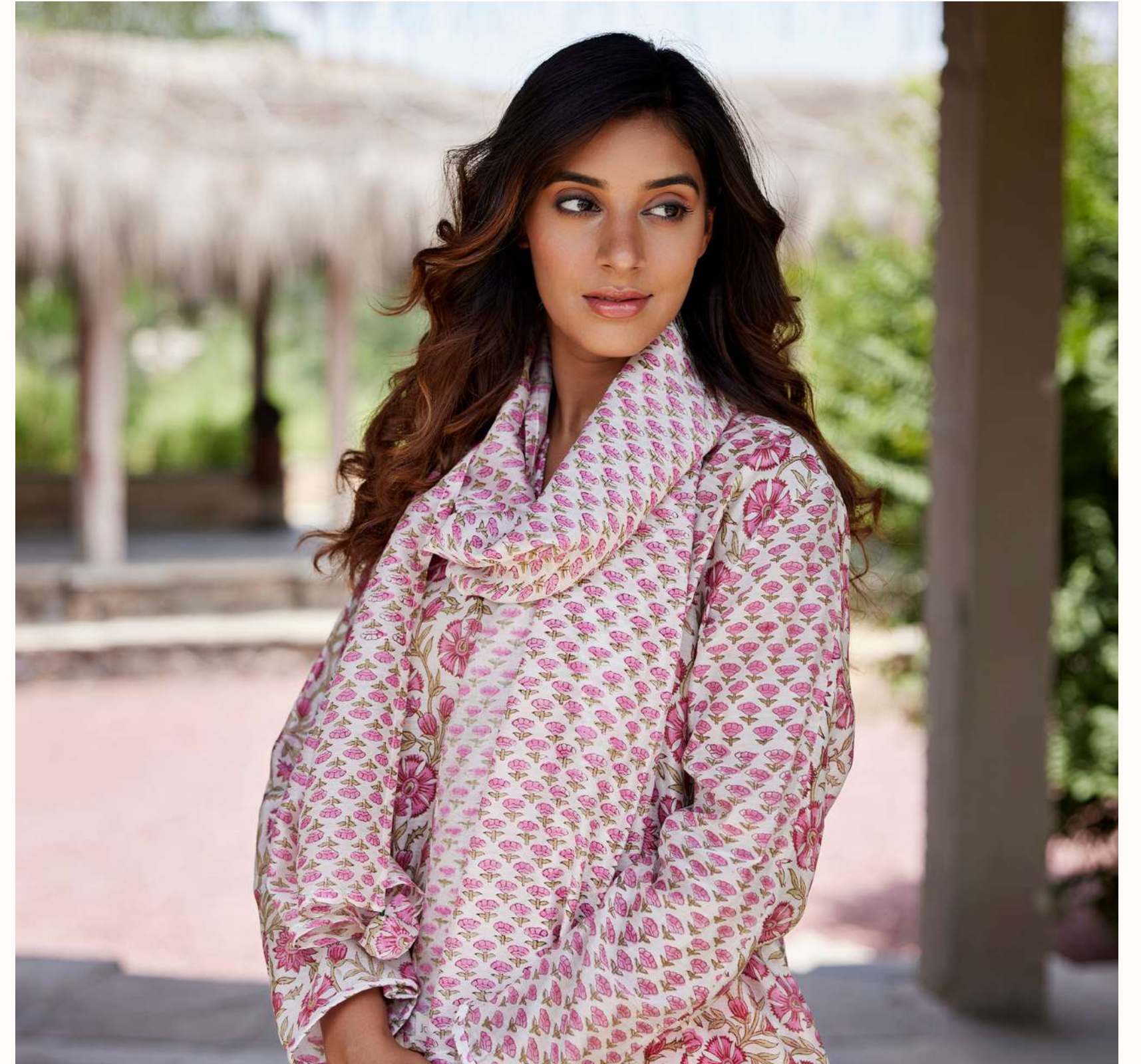
FLORAL BLOCK PRINT V NECK KURTA SET