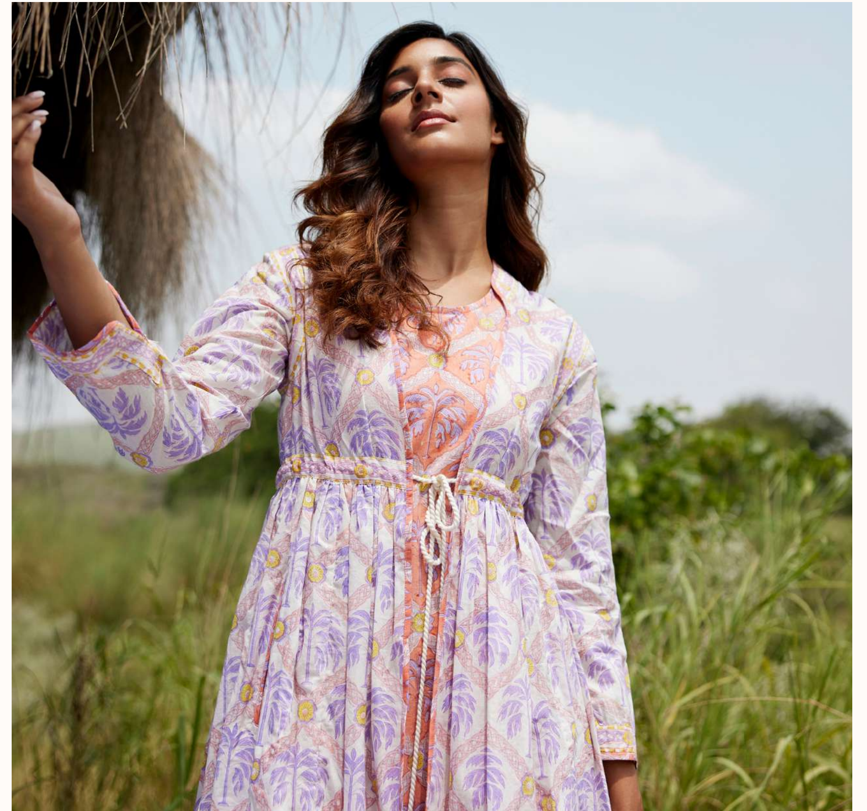
PALM OVERLAY WITH SLIP