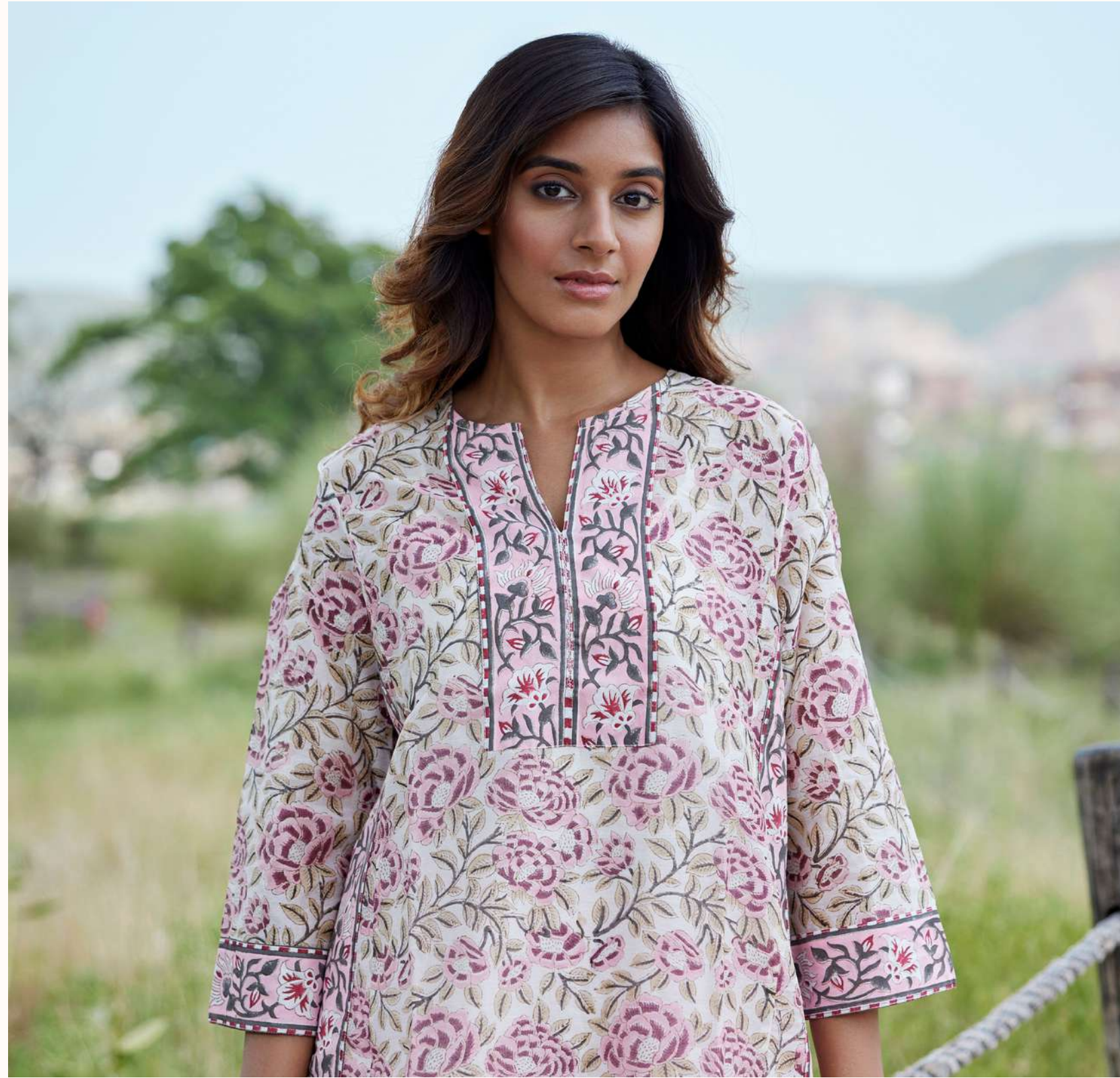
ROSE IVORY CHANDERI PANEL KURTA