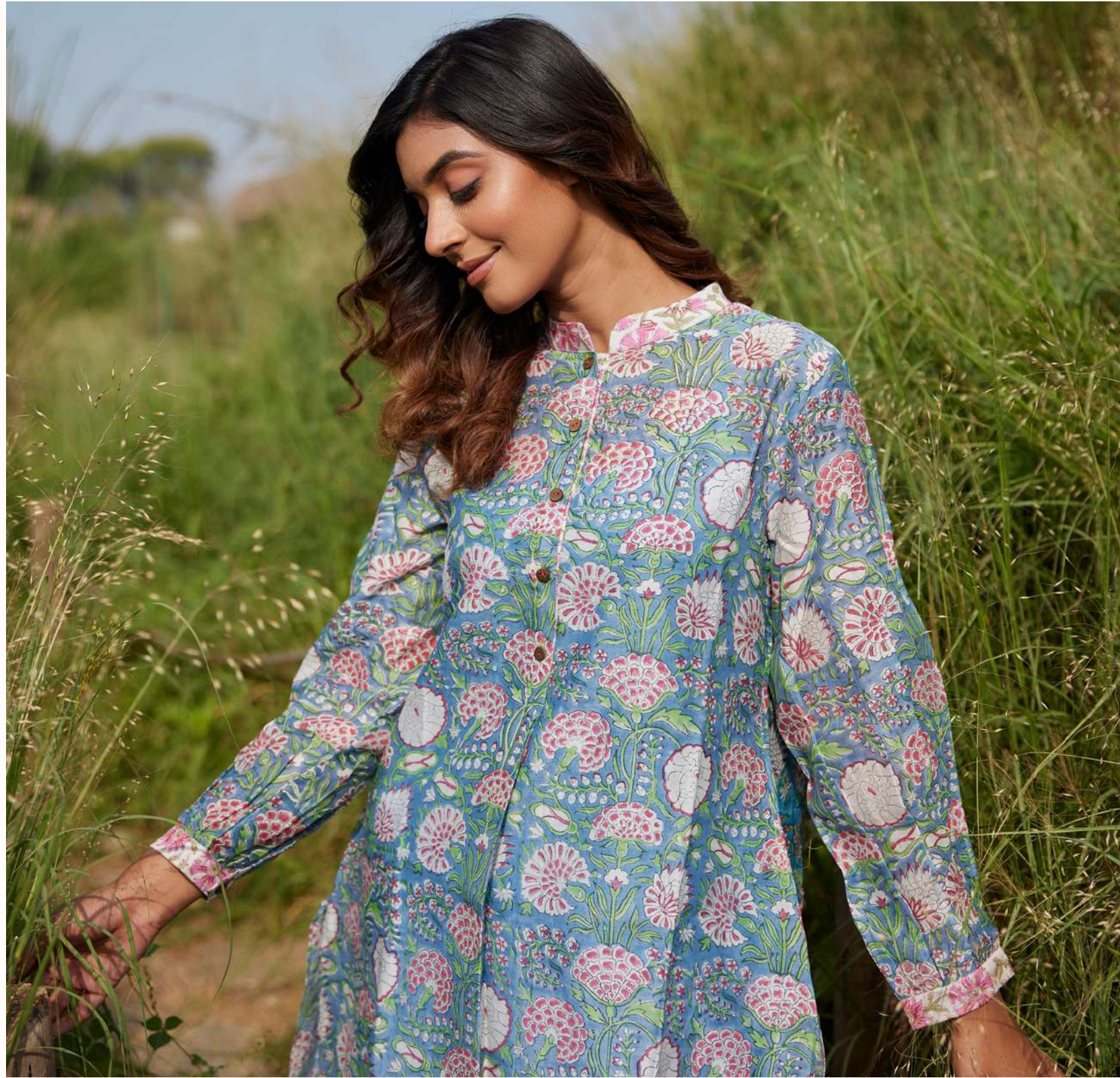
INDIGO FLORAL BLOCK KURTA