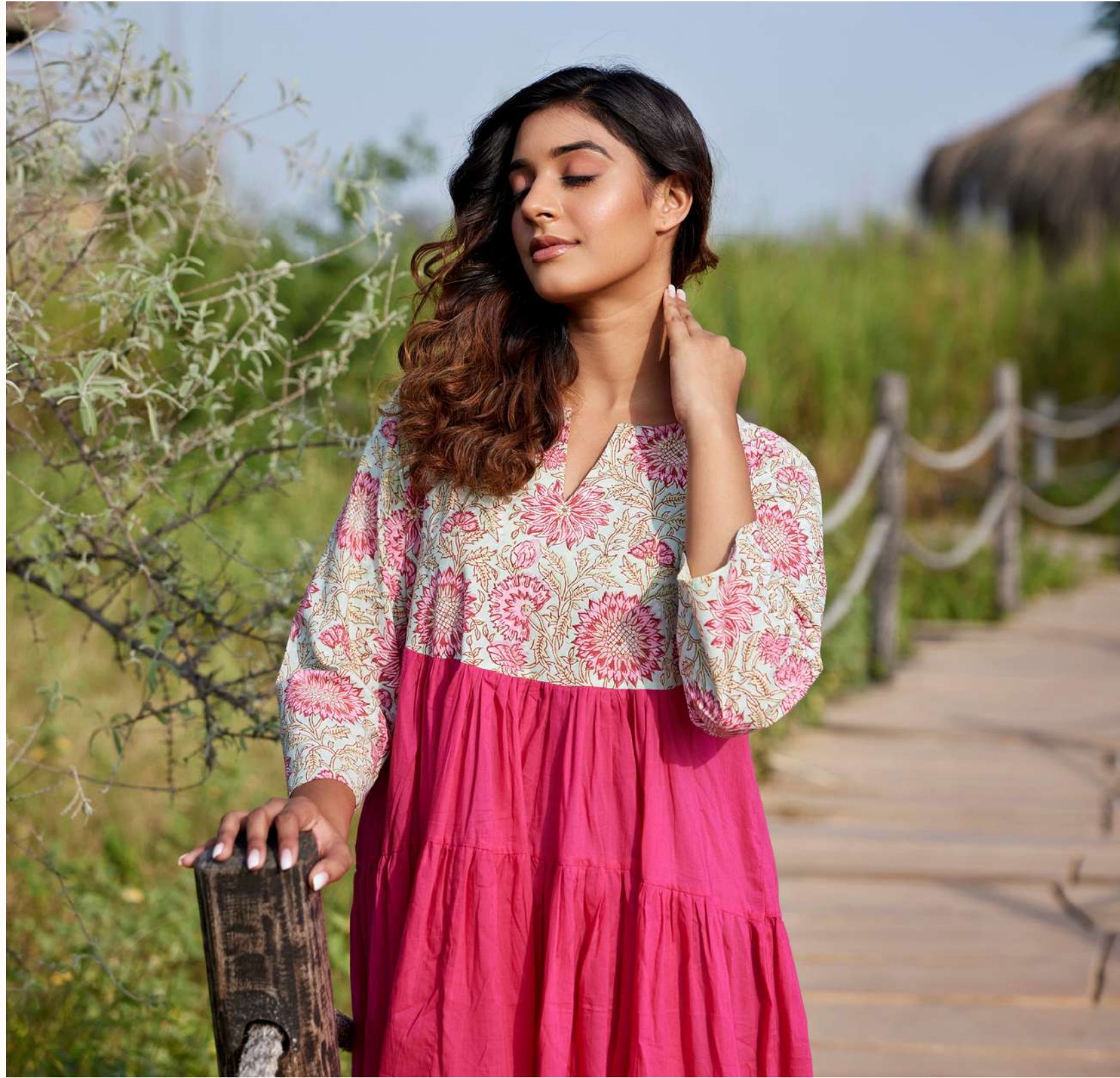
HOT PINK TIERED DRESS