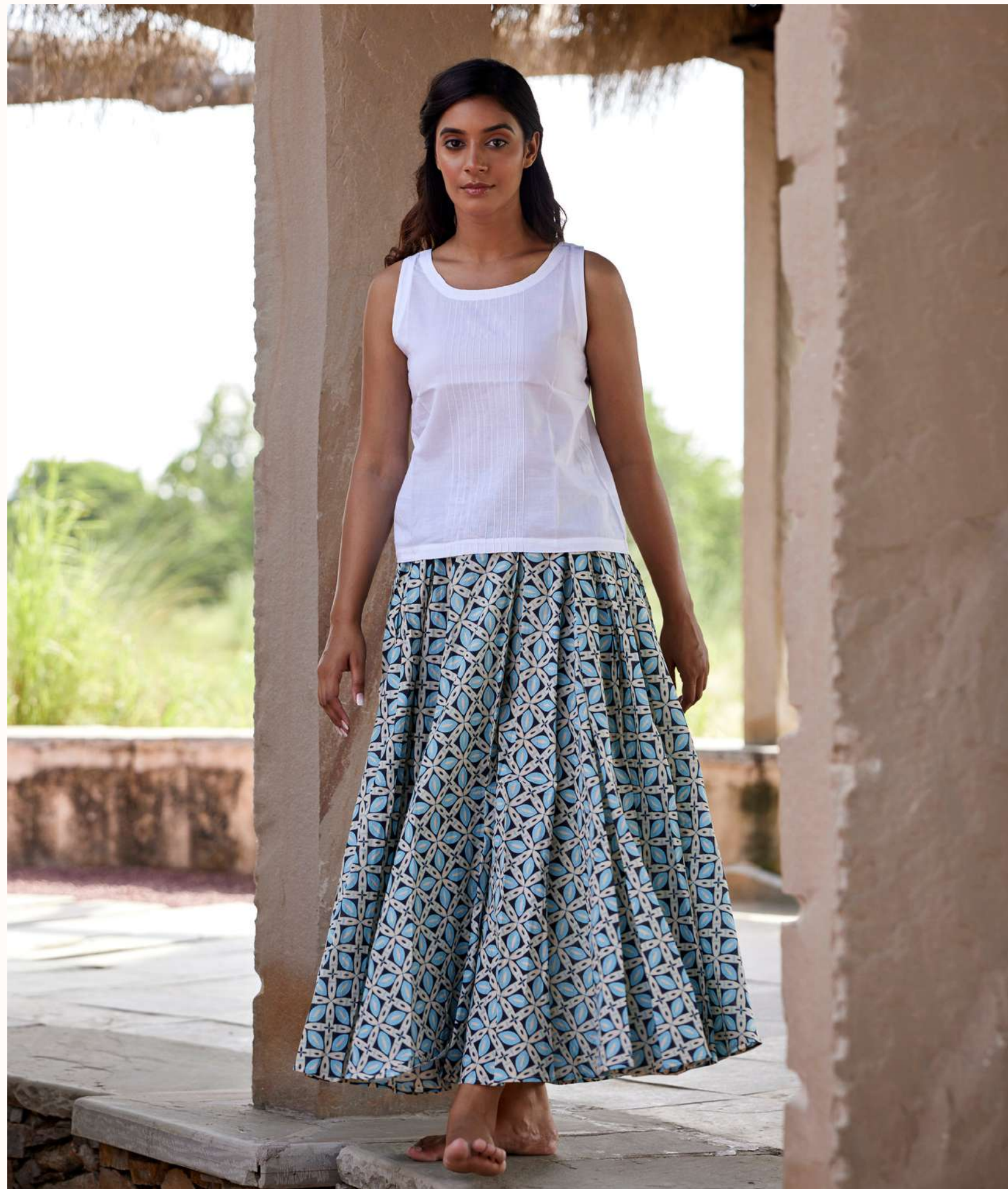
BLOCK PRINT SKIRTS