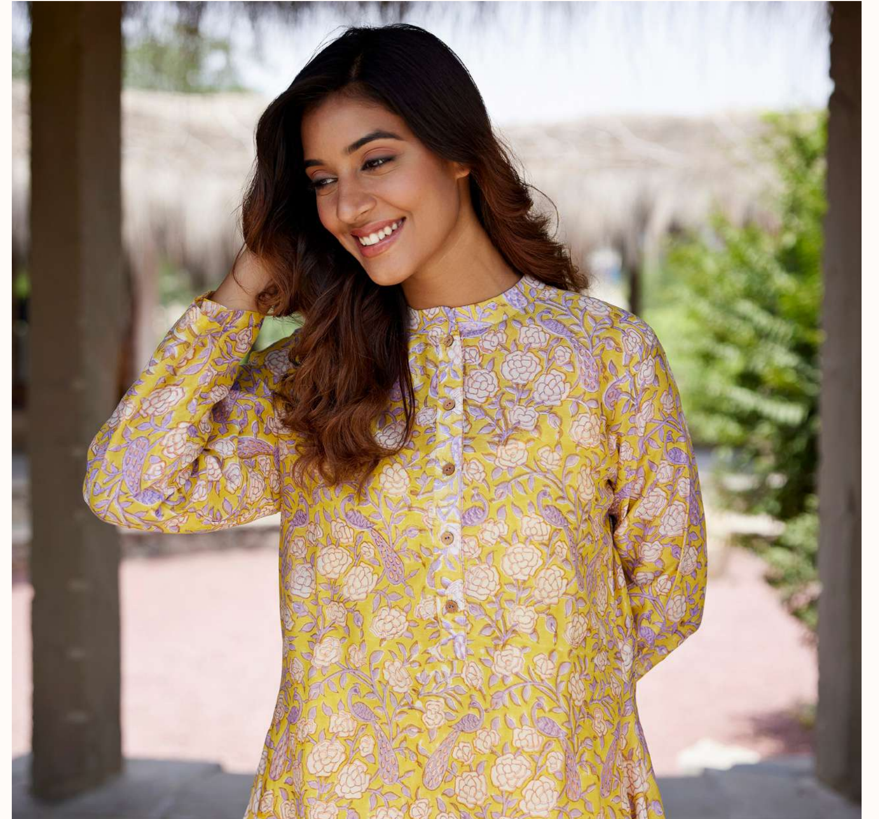
PEACOCK YELLOW CHANDERI ROUND HEM KURTA SET