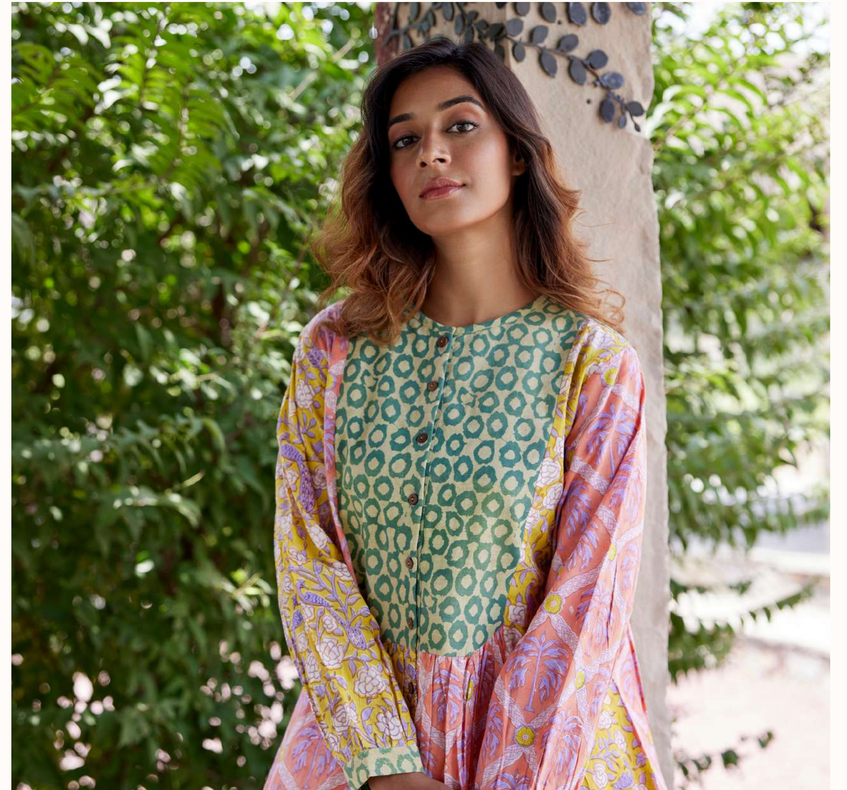
MULTI COLORED PEACOCK TOP