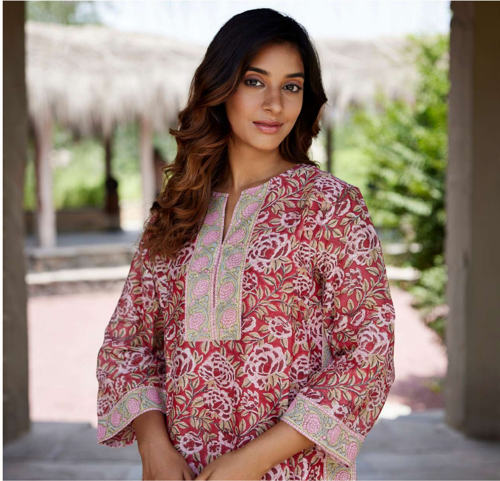
ROSE RED CHANDERI PANEL KURTA SET