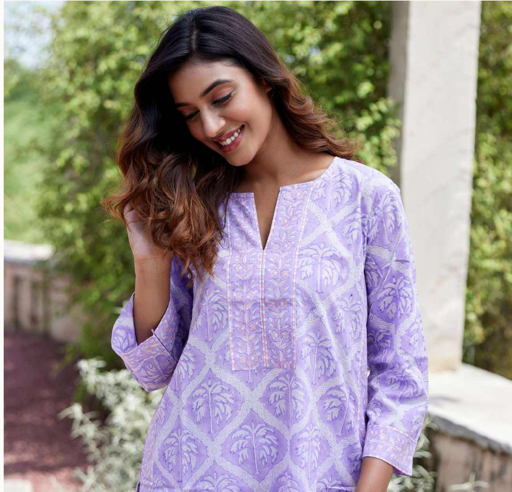
PURPLE / WHITE PALM PANEL KURTA