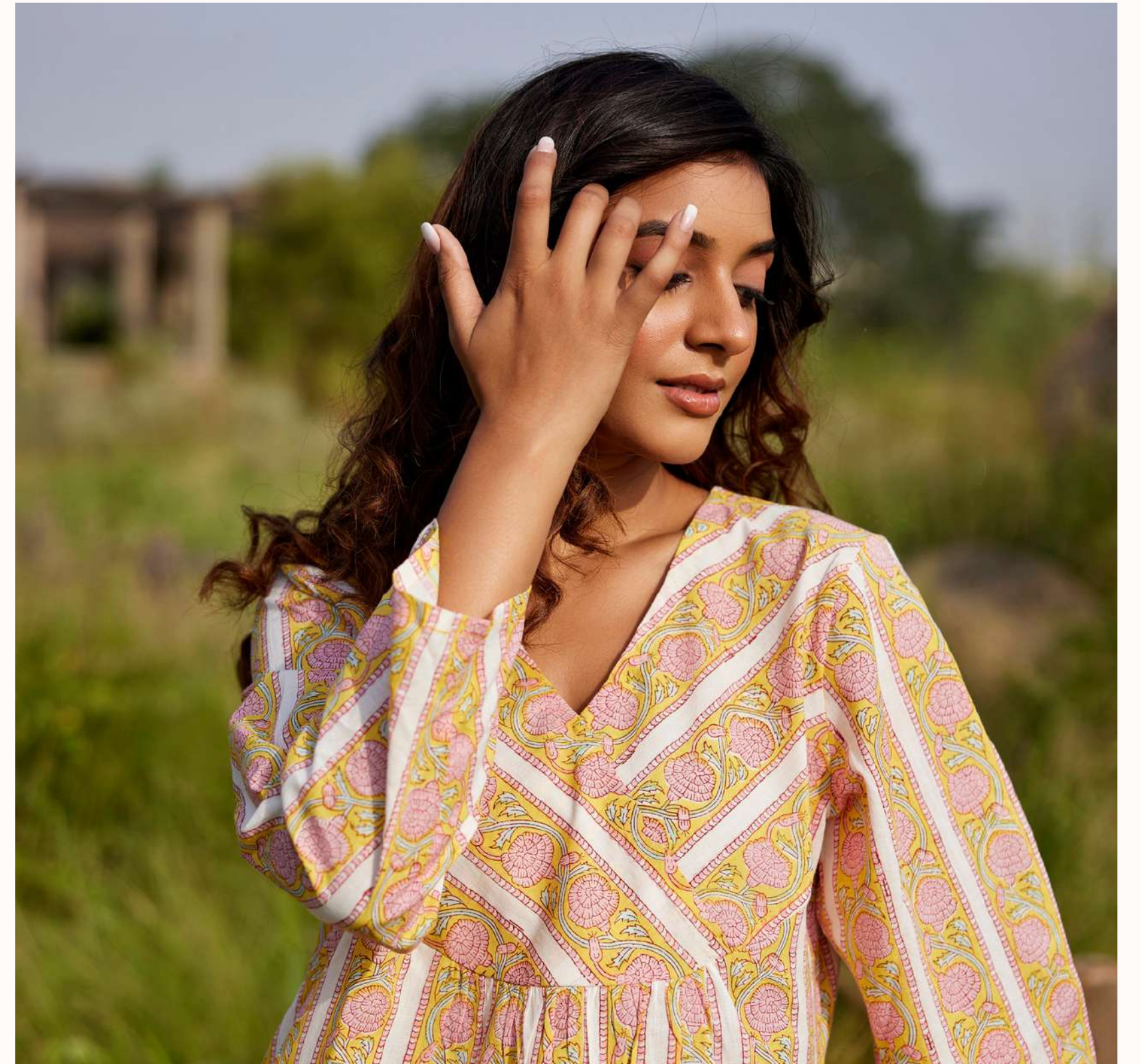
YELLOW BORDER BLOCK PRINT KURTA