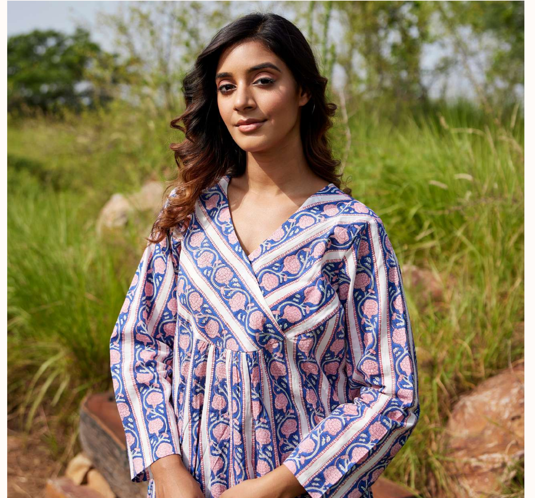
INDIGO STRIPED BLOCK KURTA