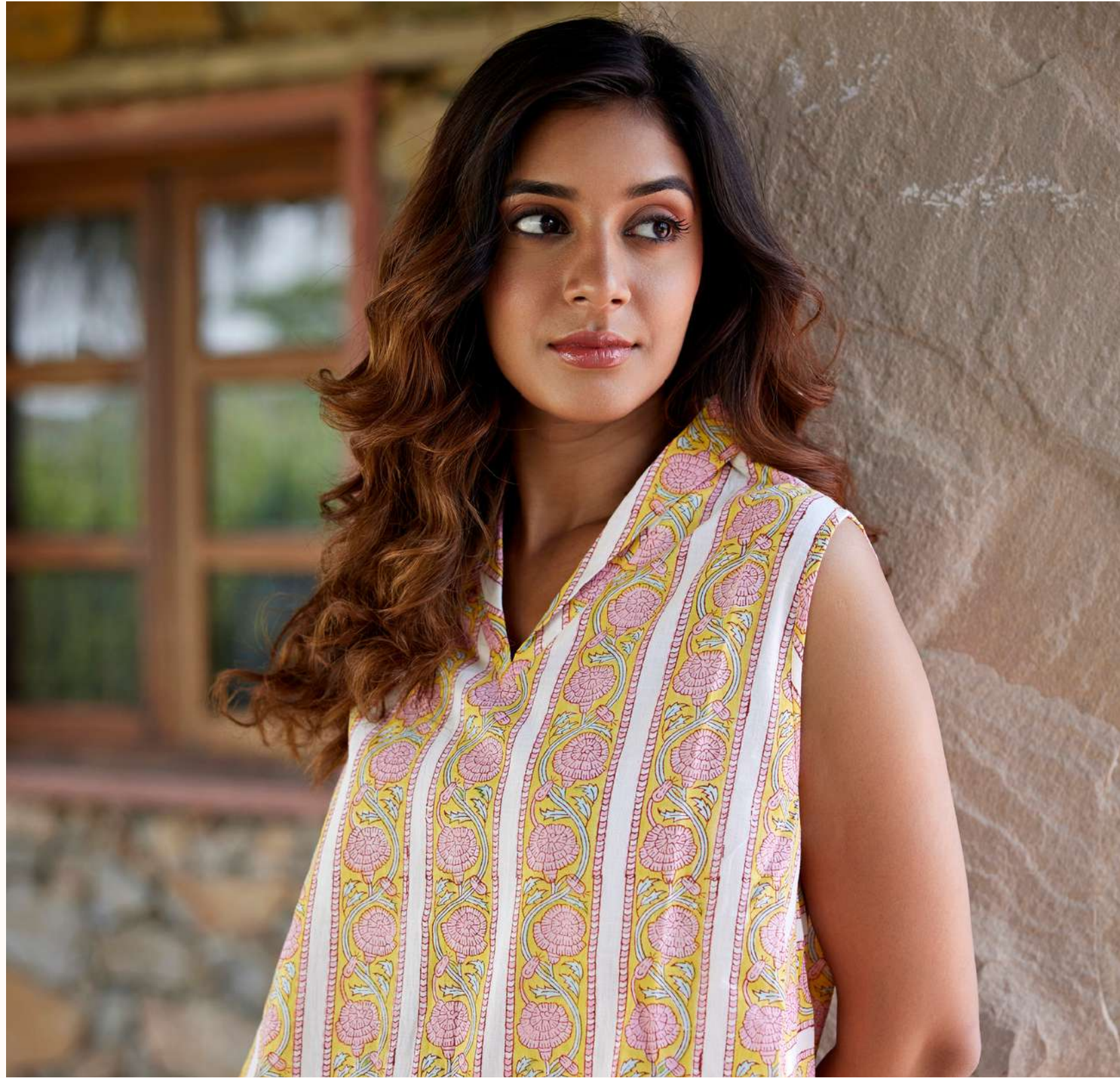
BLOCK PRINT YELLOW BORDER COTTON SHORT DRESS