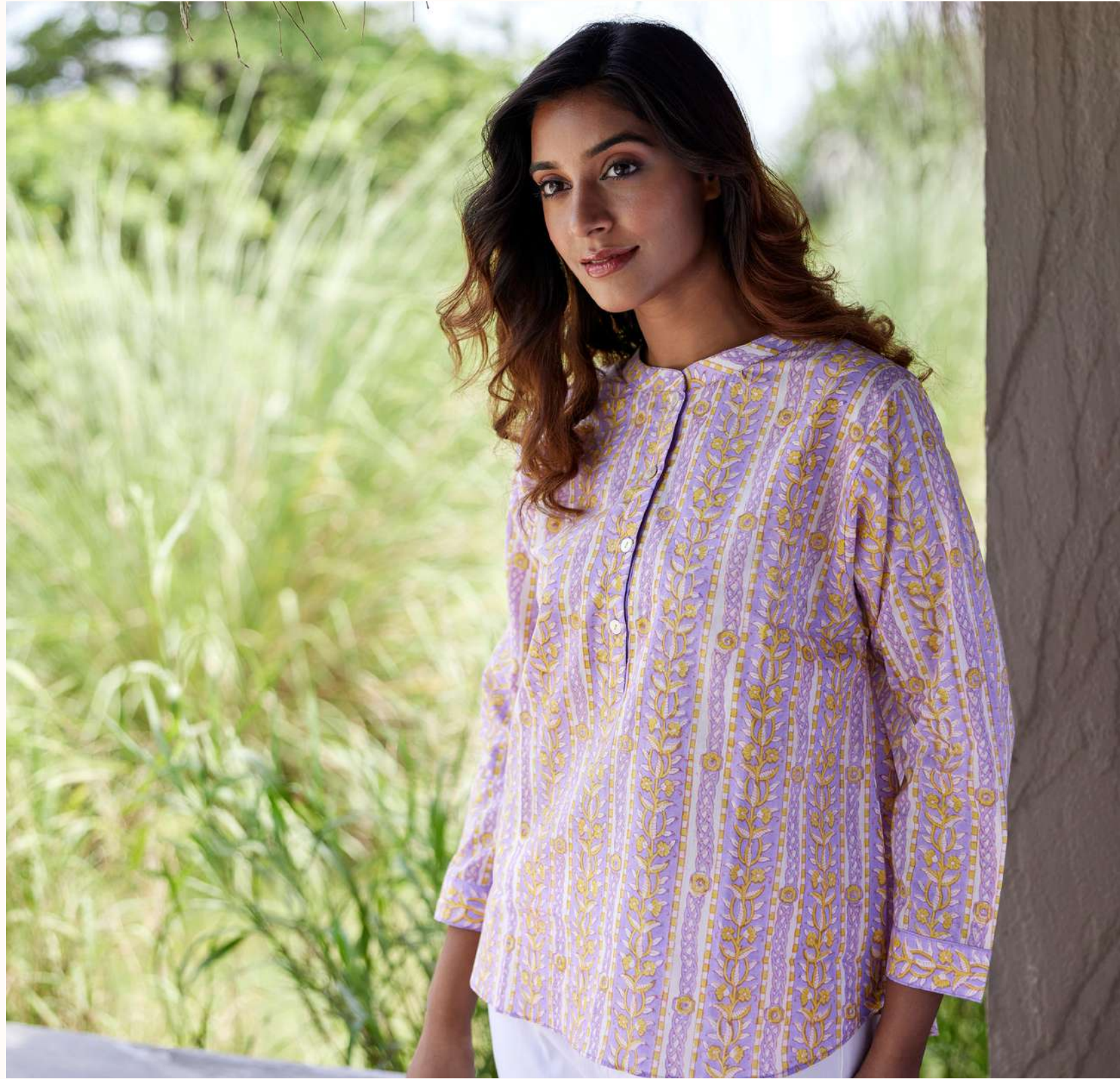
OFF WHITE/ORANGE BORDER BLOCK PRINT TOP