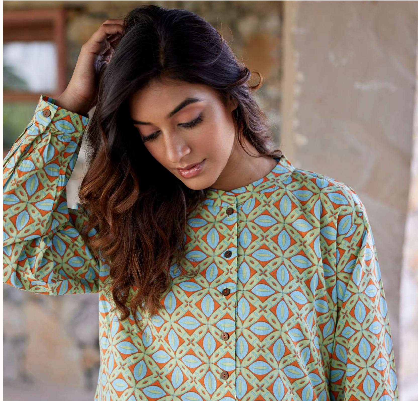
GREEN ORANGE GEOMETRIC CO-ORD SET