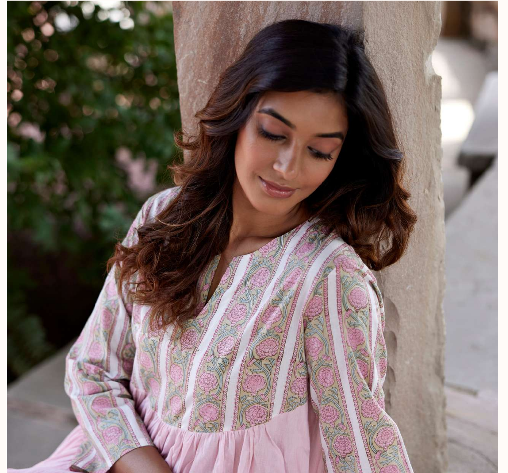
BELA FLARED KURTA / DRESS