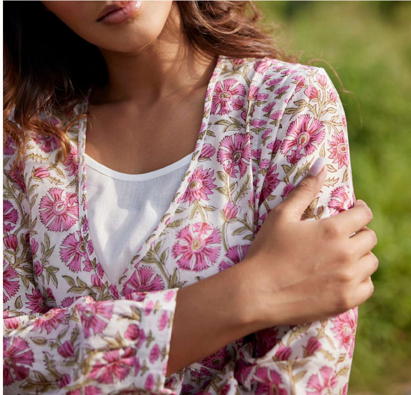
FLORAL BLOCK PRINT WRAP KURTA/ DRESS