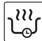
Automatic Cooking Programmes