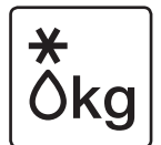
Defrost by weight