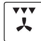
Gratin: ventilated grill