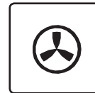
Baking: fan forced