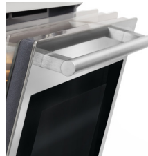
S-move soft & gentle closing door hinges