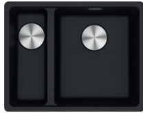
MRG260-34/15 SBL ON