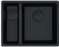
MRG260-34/15 SBL MB