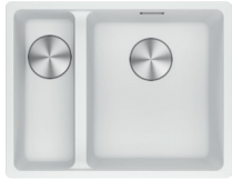
MRG260-34/15 SBL PW