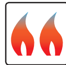
Natural Gas and LPG