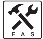
Easy Access Servicing