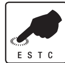
Electronic Sensor Touch Controls