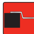
Semi flush top