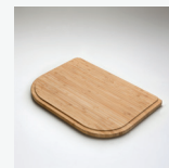
AC15 Bamboo Board