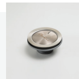
AC28 Basket Waste