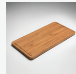
ACP124 Bamboo Board