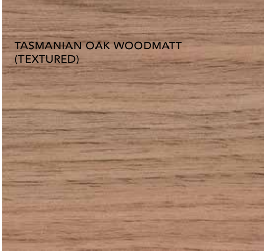
TASMANIAN OAK WOODMATT (TEXTURED)