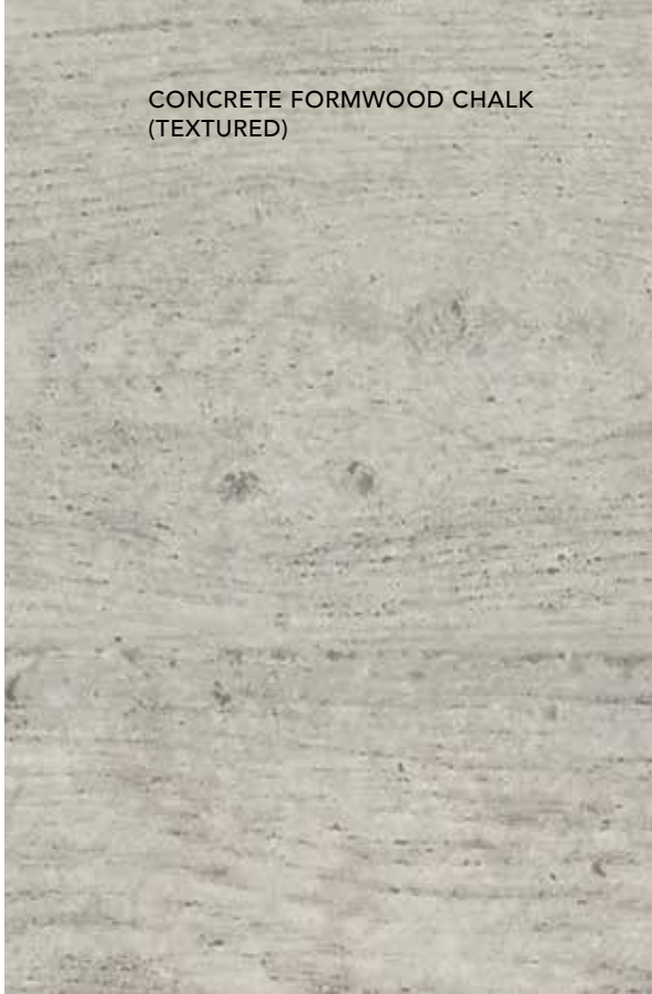
CONCRETE FORMWOOD CHALK (TEXTURED)