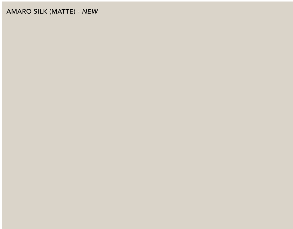
AMARO SILK (MATTE) - NEW