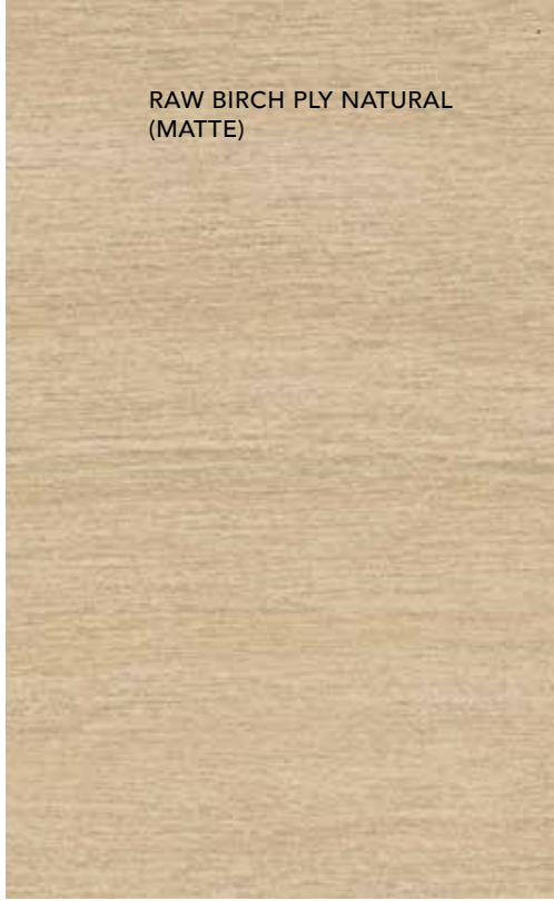
RAW BIRCH PLY NATURAL (MATTE)