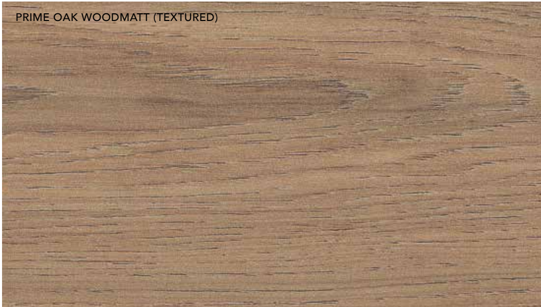
PRIME OAK WOODMATT (TEXTURED)