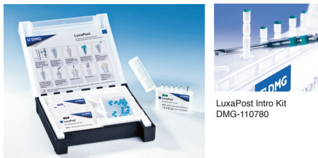
LuxaPost Intro Kit DMG-110780

✓ Glass fiber reinforced pre-silanized composite post with dentine-like flexural modules