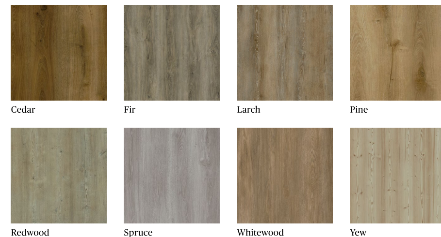
Cedar Fir Larch Pine Redwood Spruce Whitewood Yew