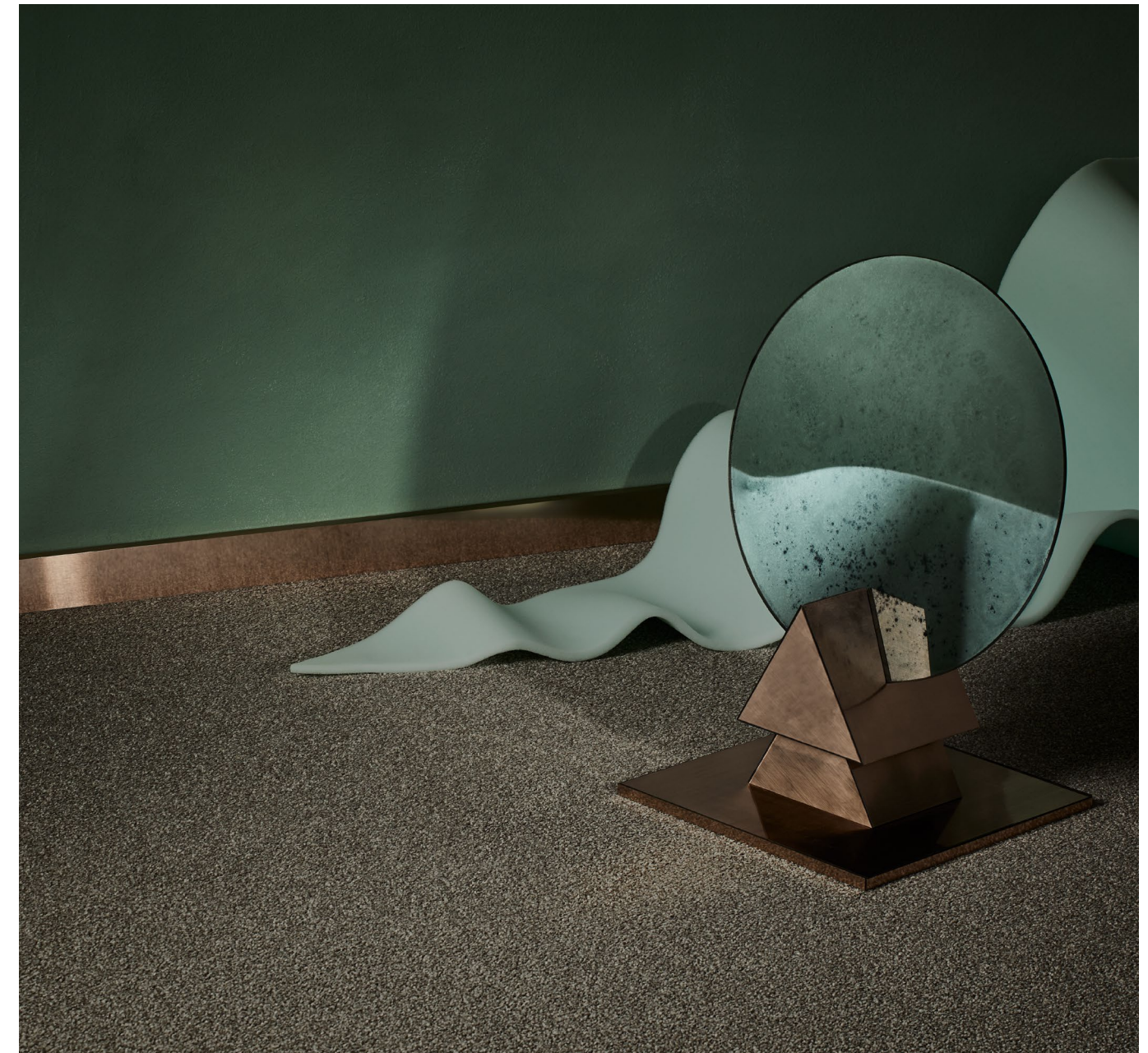
The Escape Collection: Mantra - Patina | M301