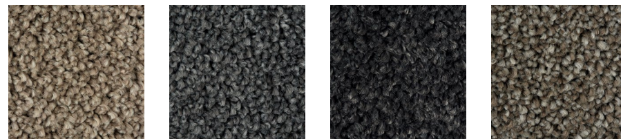
Flaxen Inky Loam Patina